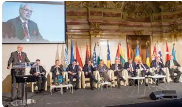
Opening by President Dr. Erhard Busek