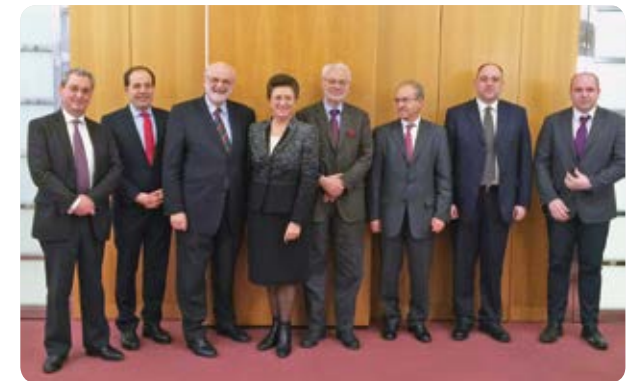
Members of the Board of Vienna Economic Forum