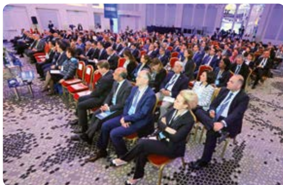
WAIPA auditorium with interested participants