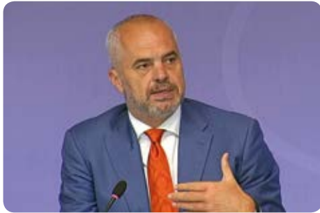
H.E. Edi Rama, Prime Minister of Albania