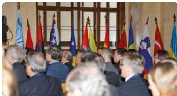
listening to H.E. Kristalina Georgieva, Vice-President of the European Commission, European Commissioner for Budget and Human Resources with Secretary