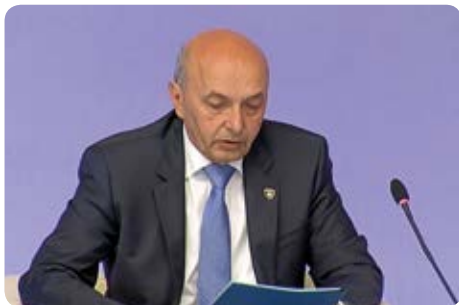
H.E. Isa Mustafa, Prime Minister of Kosovo