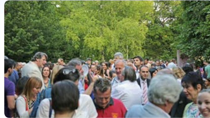
get together ...