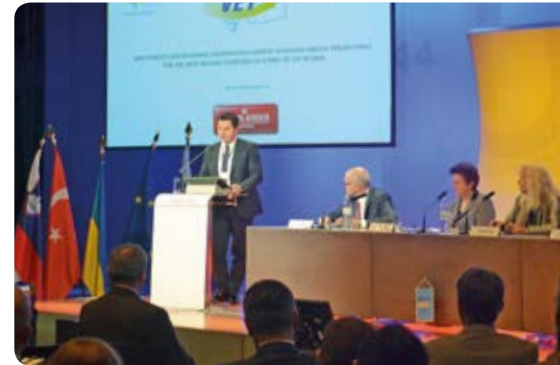
H.E. Furkan Cako, Minister for Foreign Investments of Macedonia