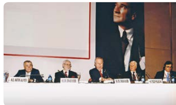
the podium at the opening of the 18 th Eurasian Economic Summit of Marmara Group Foundation