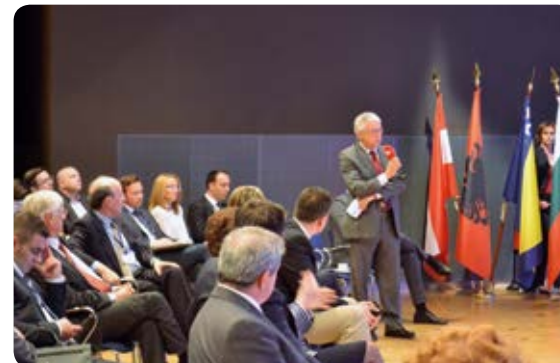
lively discussion ...