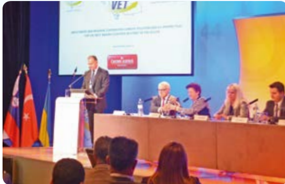
Mr. Liuben Petrov, Deputy Minister of Economy of the Republic of Bulgaria