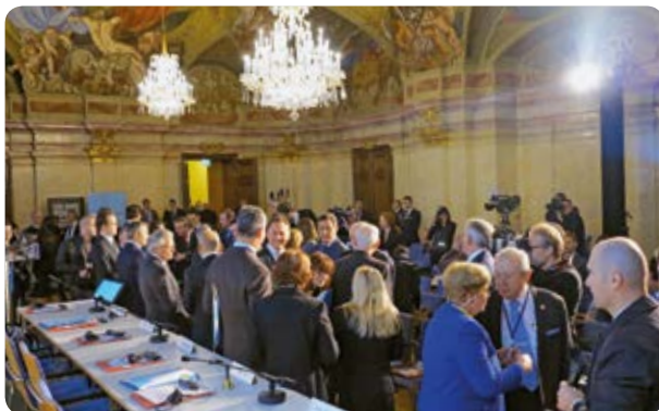
many talks and exchange of ideas