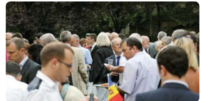
good atmosphere ...