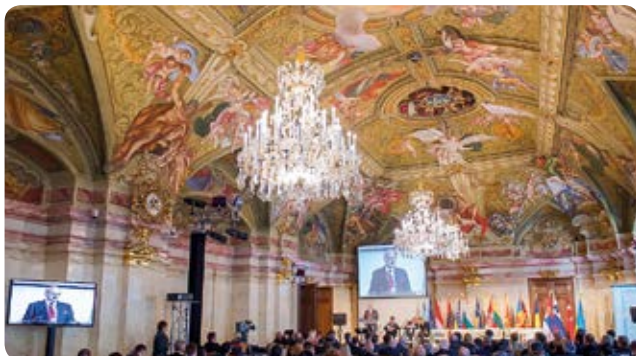
growing interest in a turbulent time