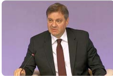
H.E. Denis Zvizdic, Prime Minister of Bosnia and Herzegovina