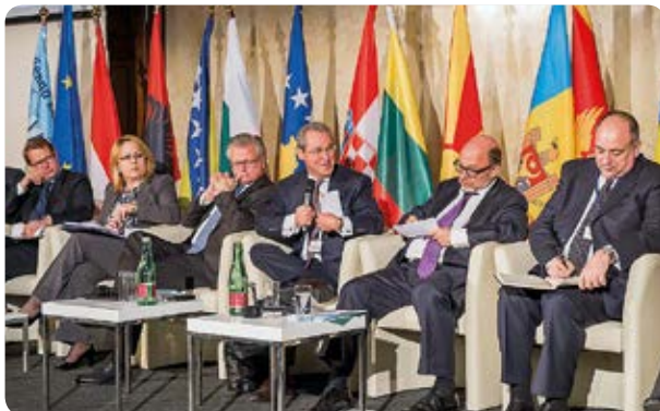
vivid discussion on the panel