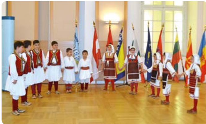
kids from the region ...