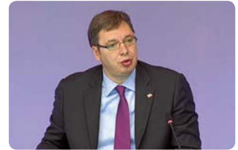
H.E. Aleksandar Vucic, Prime Minister of Serbia