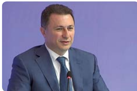
H.E. Nikola Gruevski, Prime Minister of Macedonia