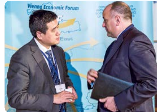
exchange of experiences