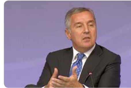
H.E. Milo Djukanovic, Prime Minister of Montenegro