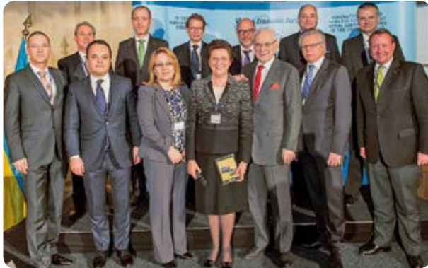
Family photo 2nd panel