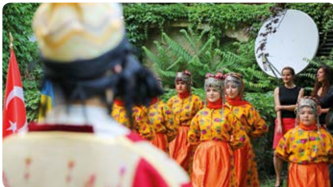
masterly dancers ...