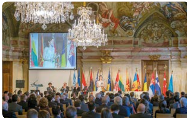
musical framework at the opening