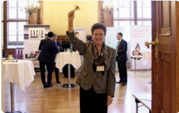
the Secretary General invites