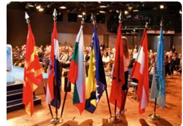
the interested auditorium in the Studio 44