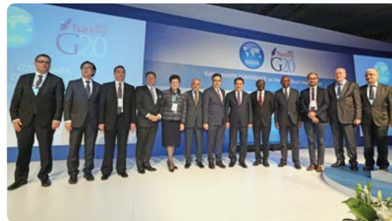
Family photo of the high represantives from the world with H.E. Ali Babacan, Deputy Prime Minister for Economic and Financial Affairs of Turkey

for their continues support to the work of the Eurasian Economic Summits organized by the Marmara Group Foundation for the last 10 years and their unwavering efforts for peace, prosperity and stability of the region