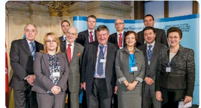
Family photo of the 1st panel