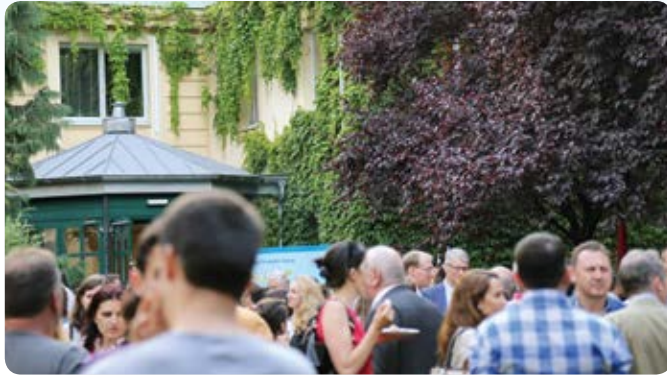
so much in common between the people from the region ...