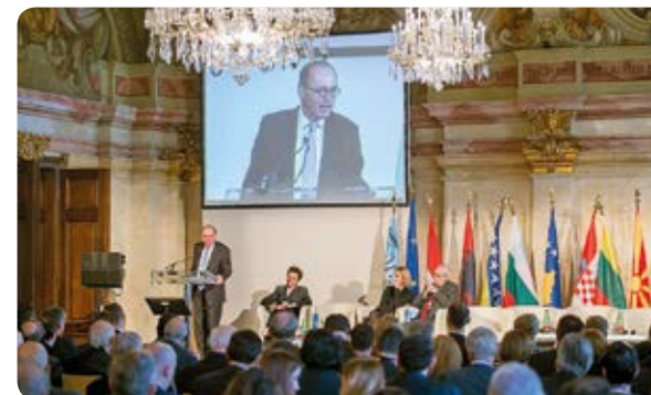
Mag. Othmar Karas, Member of the European Parliament