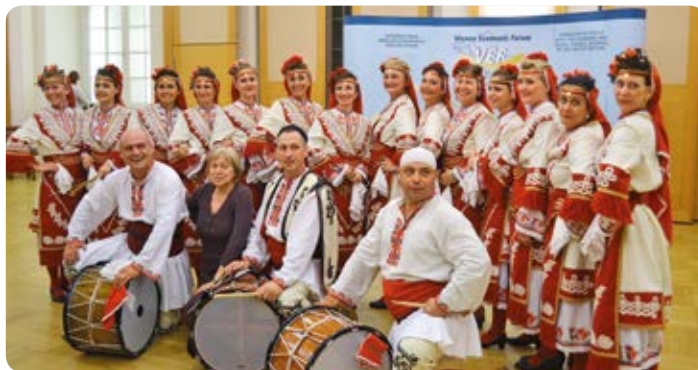
Bulgarian dance group