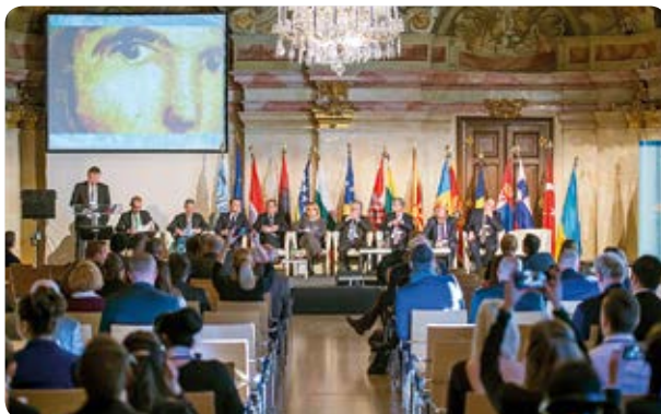
attentive talks on topics