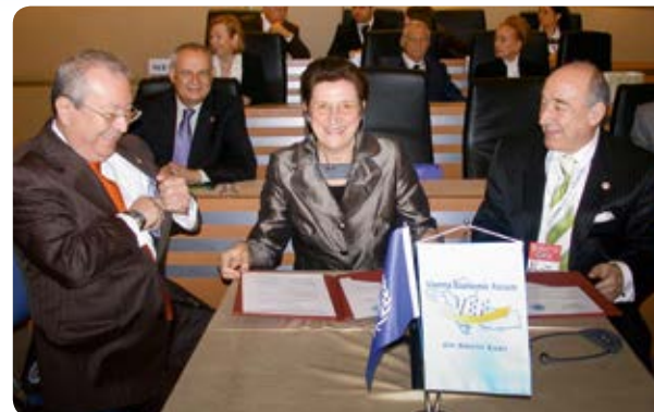
The signing of the Memorandum of Understanding between Vienna Economic Forum and Marmara Group Foundation