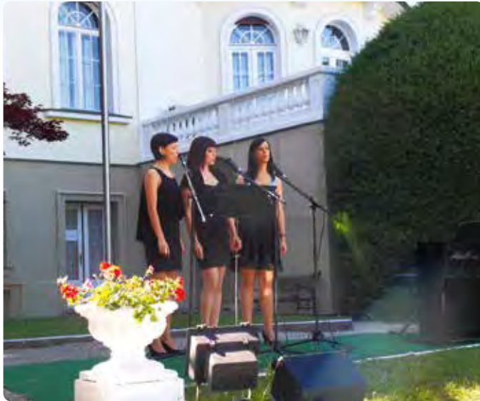
Musical performance of traditional songs from Macedonia ...