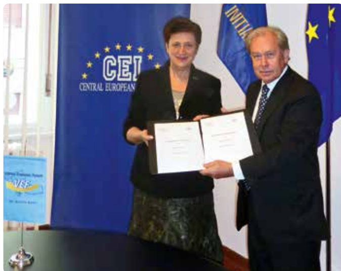
Memorandum of Understanding between Vienna Economic Forum and Central European Initiative (CEI), Trieste, Italy