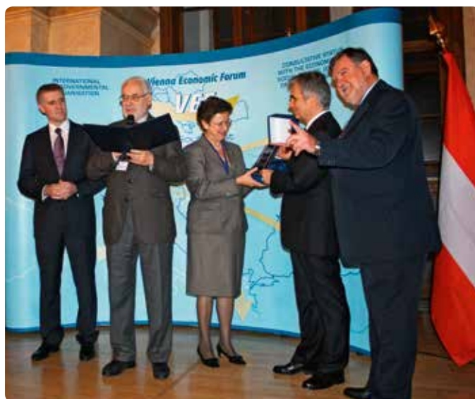
Vienna Economic Forum Award 2012 to H.E. Mr. Werner Faymann, Federal Chancellor of the Republic of Austria and Patron of Vienna Economic Forum

H.E. Ms. Mimoza Kusari-Lila, Deputy Prime Minister and Minister for Trade and Industry of Kosovo