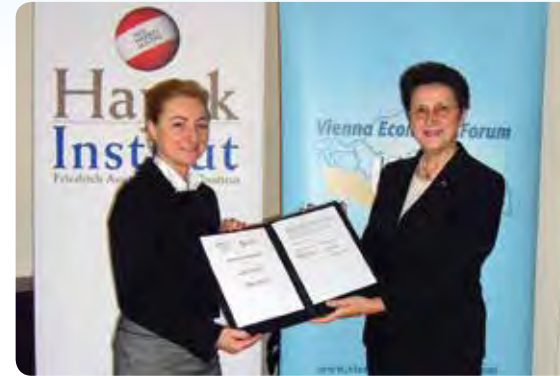
Memorandum of Understanding between Vienna Economic Forum and Hayek Institut, Vienna