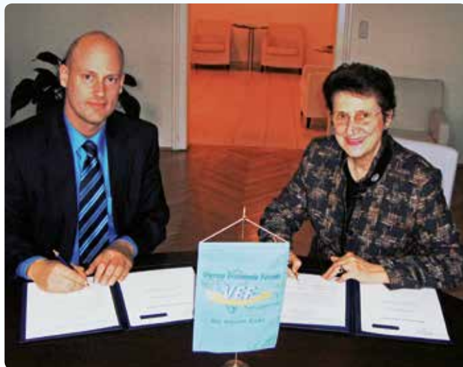
Memorandum of Understanding between Vienna Economic Forum and EastEuroCo Executive Search Group Ltd., Budapest, Hungary