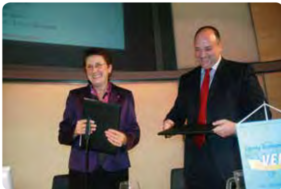
Memorandum of Understanding between Vienna Economic Forum and Foreign Investors Services d.o.o, Belgrade