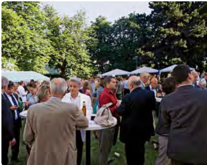
... and enjoying ...