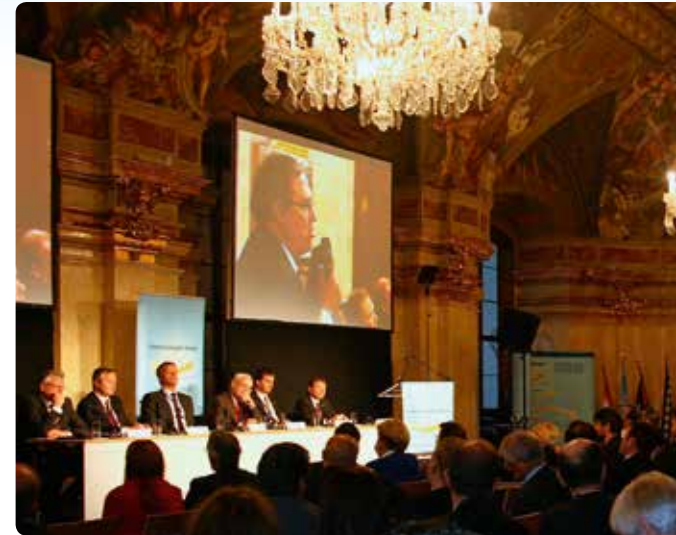
Third Plenary Session „The Danube Region – European Challenges. Energy, Transport, Logistics. Social Responsibility“