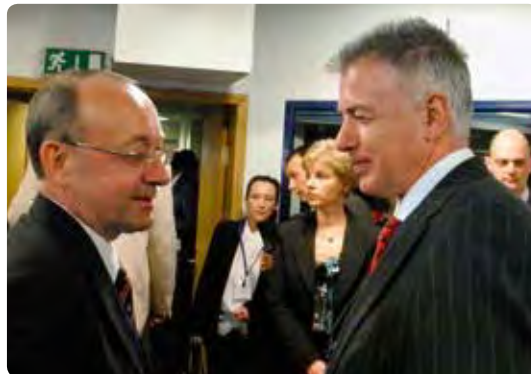
Intensive Talks during Vienna Economic Talks – Sofia Meeting 2012