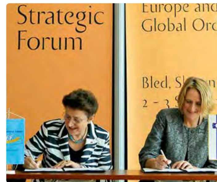
Memorandum of Understanding between Vienna Economic Forum and Bled Strategic Forum, Bled, Slovenia