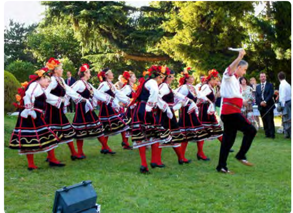
Traditional folklore dances