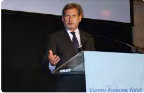
H.E. Dr. Johannes Hahn, European Commissioner for Regional Policy