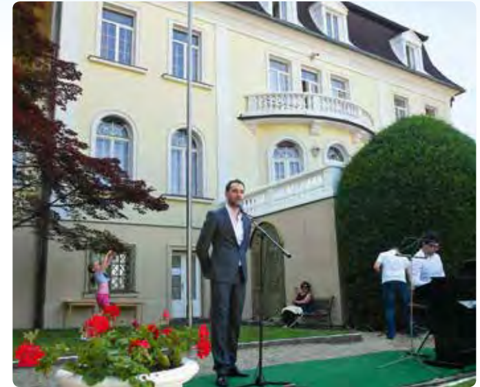
... Kosovo ...