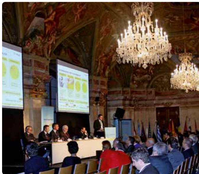
Third Plenary Session „The Danube Region – European Challenges. Energy, Transport, Logistics. Social Responsibility“