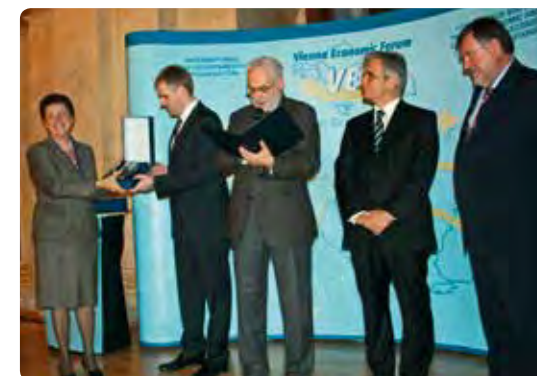
Vienna Economic Forum Award 2012 to H.E. Mr. Igor Luksic, Prime Minister of Montenegro, Patron of Vienna Economic Forum