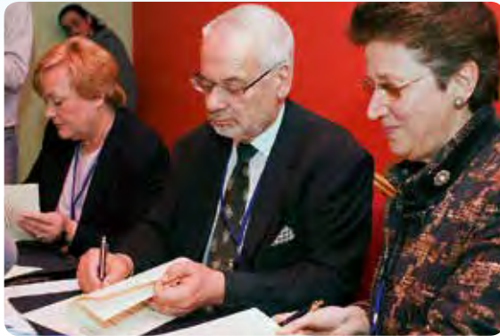
Memorandum of Understanding between Vienna Economic Forum and EUROPEAN CENTER FOR ENVIRONMENTAL ECONOMY (ECEE), Sofia