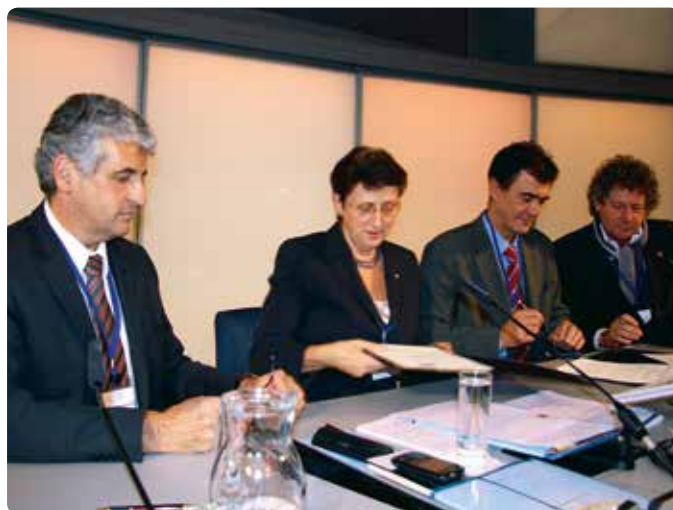
Memorandum of Understanding between Vienna Economic Forum and Business Advisory Council for South-Eastern Europe, Thessaloniki, Greece