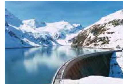
Pumped Storage Power Plant Kaprun

VERBUND is Austria's leading electricity company and one of the leading hydropower producers in Europe.