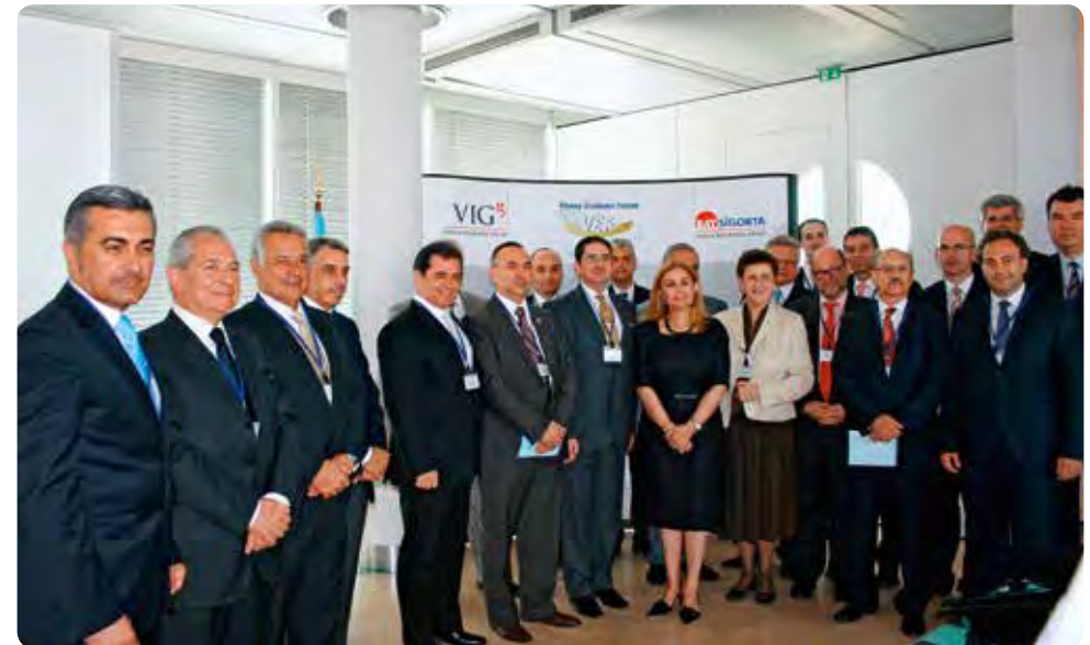
Family Foto in Ringturm with high-ranking representatives of the Turkish economy and Members of the Board of Vienna Economic Forum

in cooperation with Vienna Insurance Group, Ray Sigorta A.S. and Verbund AG