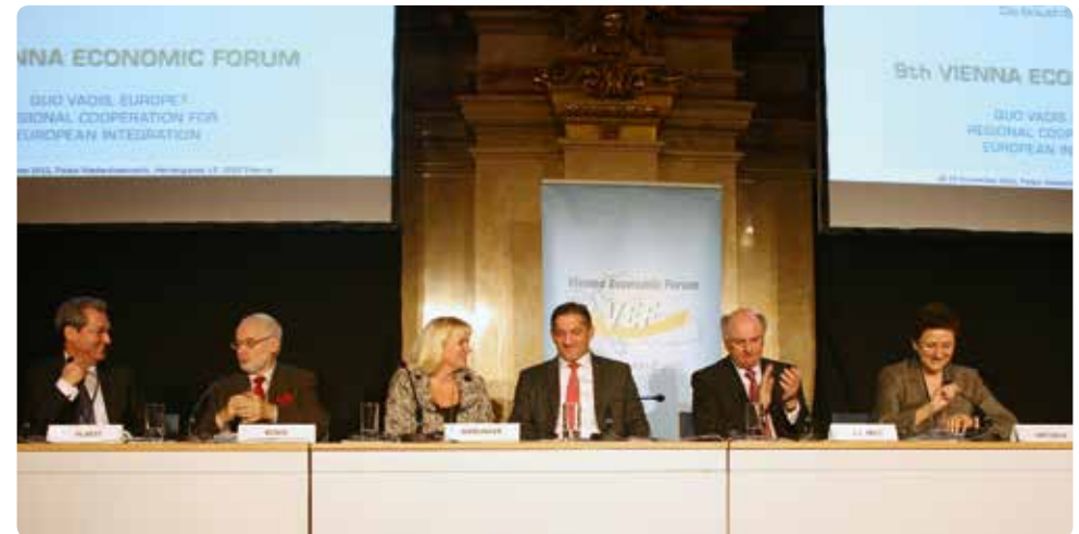
First Opening Plenary Session „Quo vadis, Europe? Regional Cooperation for European Integration“