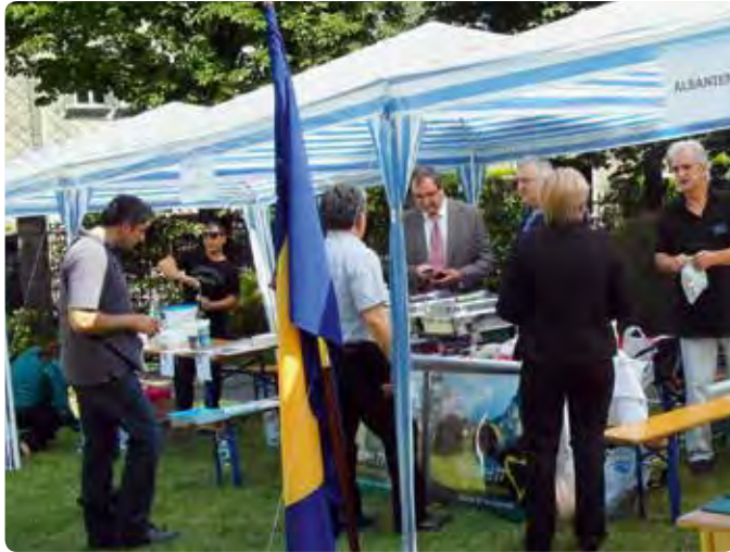
Preparation of the Albanian stand