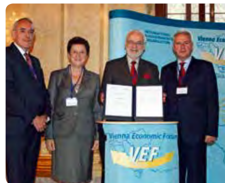
Memorandum of Understanding between Vienna Economic Forum and Confederation of the Employers and Industrialists in Bulgaria (CEIBG), Sofia, Bulgaria