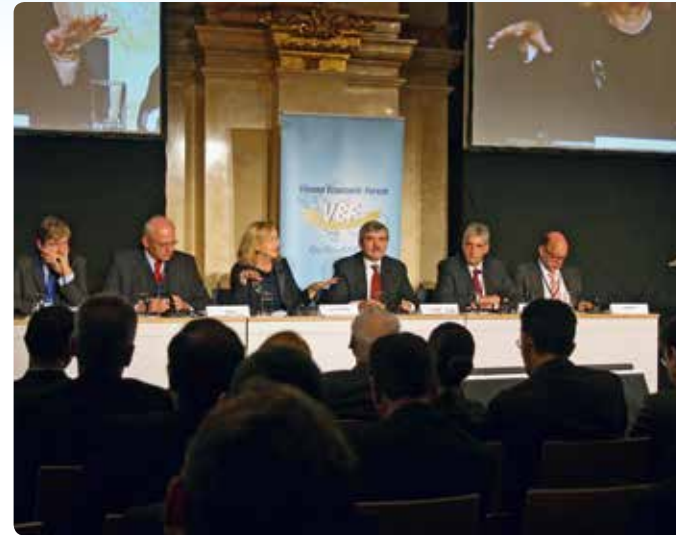
Main Statement of H.E. Dr. Maria Fekter, Federal Minister of Finance of the Republic of Austria