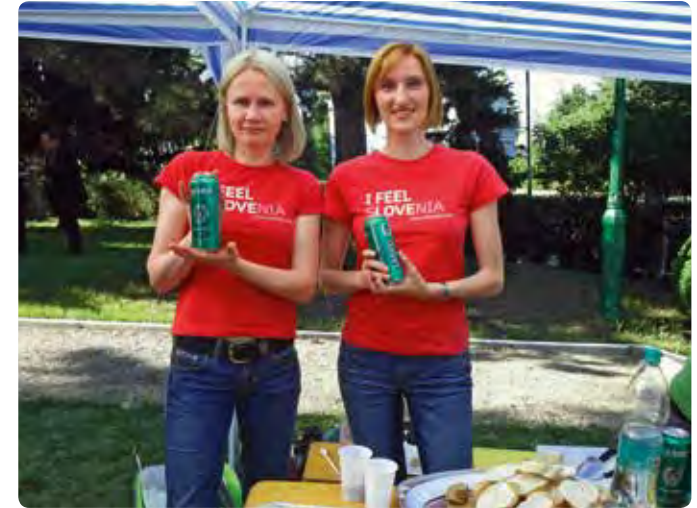
„I feel Slovenia“