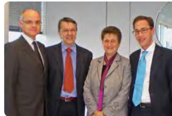
... the Vienna Economic Forum Family is working and thinking together about the further successful development of Vienna Economic Forum