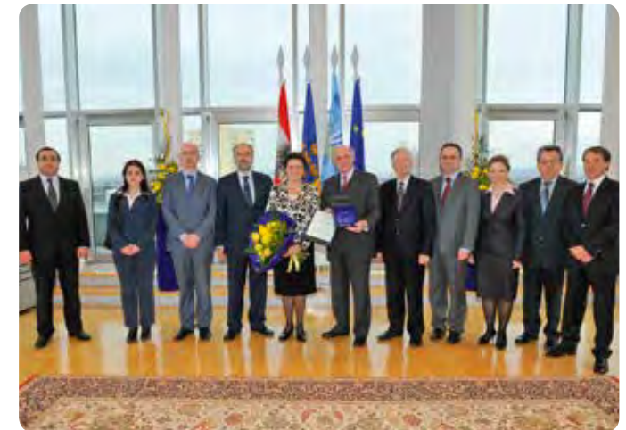
Festivity for H.E. Dr. Erwin Pröll, Governor of the Province of Lower Austria on the occasion of the Vienna Economic Forum Award 2011 – ceremony with the Ambassadors Committee of Vienna Economic Forum