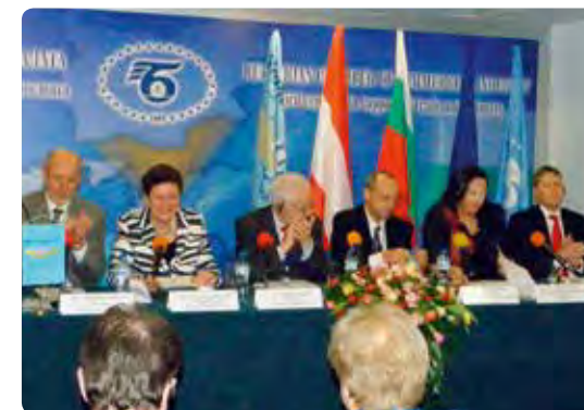
The Chair of the First Plenary Session