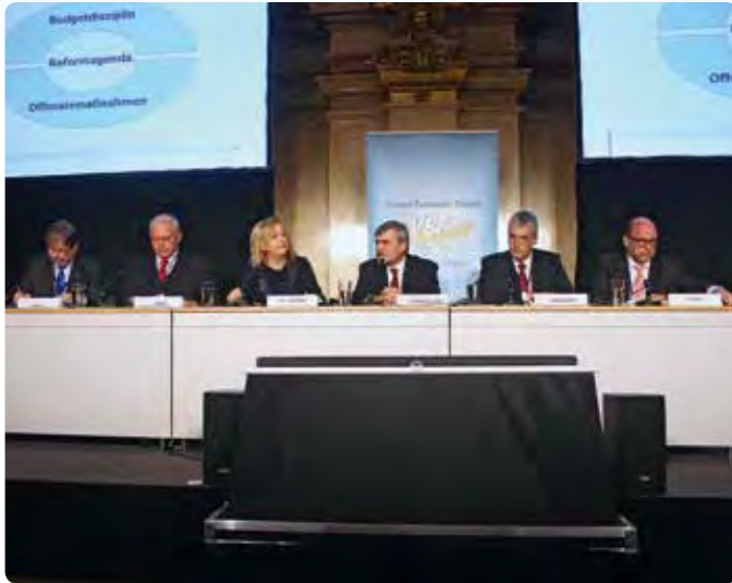
Second Plenary Session „Growth and Finance – Motors in New Frameworks. Infrastructure and Innovative Locations. The Fresh Wind“ with H.E. Dr. Maria Fekter, Federal Minister of Finance of the Republic of Austria