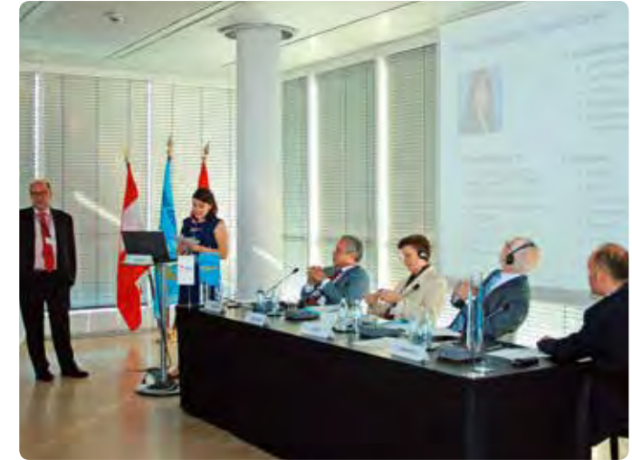
Presentation of Lansky, Ganzger + Partner Attorneys and their activities in Turkey