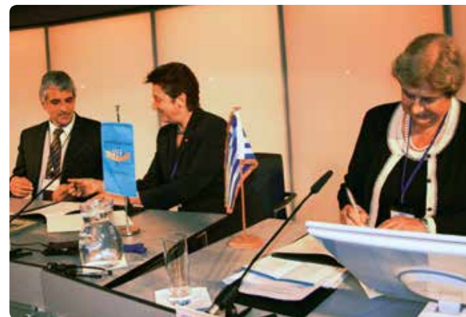
Memorandum of Understanding between Vienna Economic Forum and Biopolitics International Organisation (B.I.O.), Athens, Greece