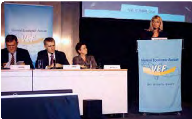
Statement of H.E. Ms. Mimoza Kusari-Lila, Deputy Prime Minister and Minister for Trade and Industry of Kosovo