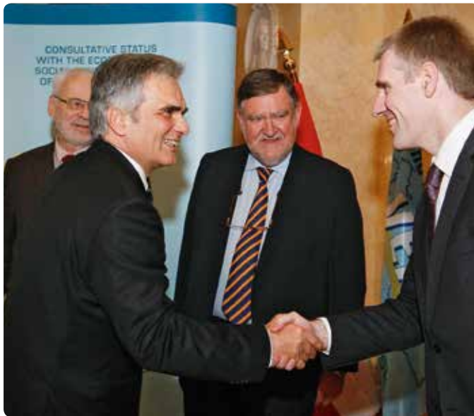
H.E. Mr. Werner Faymann, Federal Chancellor of the Republic of Austria, Patron of Vienna Economic Forum welcoming H.E. Mr. Igor Luksic, Prime Minister of Montenegro, Patron of Vienna Economic Forum