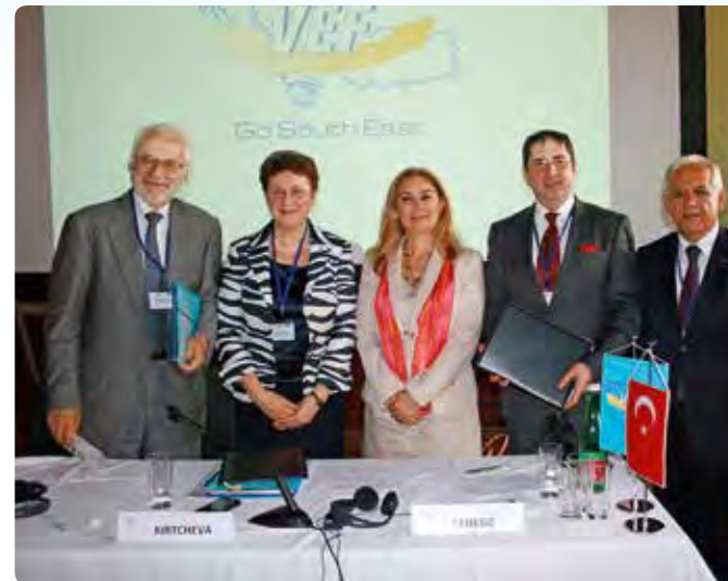
Memorandum of Understanding between Vienna Economic Forum and TURKONFED Turkish Enterprise and Business Confederation, Istanbul, Turkey