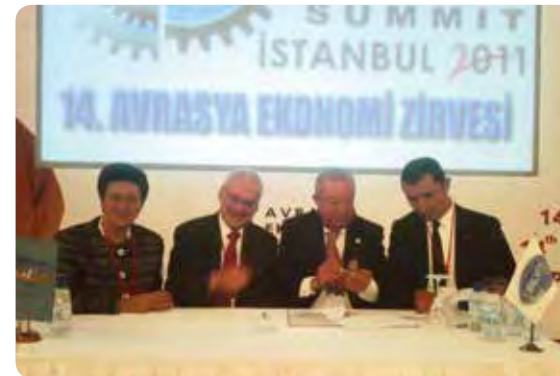
Memorandum of Understanding between Vienna Economic Forum and Union of Black Sea and Caspian Confederation of Enterprises (UBCCE), Athens, Istanbul, Baku