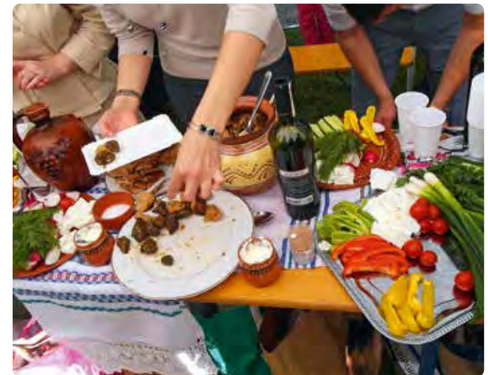
... and culinary pleasure ...