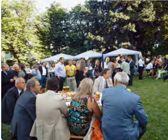
Watching the European Football Championship ...