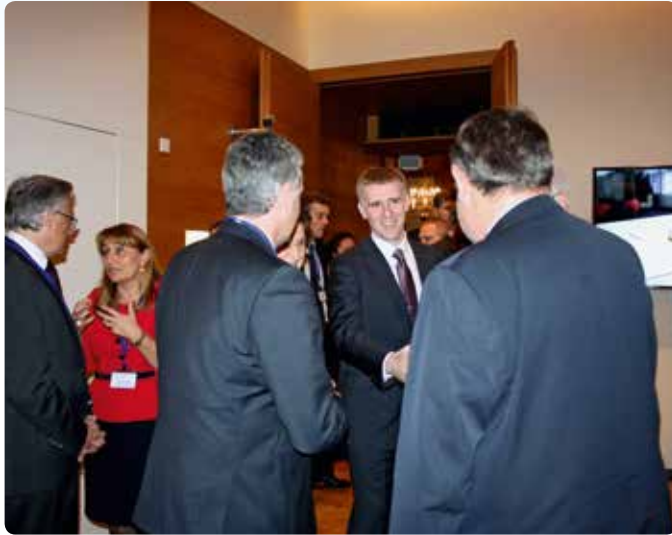
Welcome of H.E. Mr. Igor Luksic, Prime Minister of Montenegro, Patron of Vienna Economic Forum