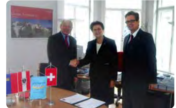
Memorandum of Understanding between Vienna Economic Forum and Handelskammer Schweiz-Österreich-Liechtenstein