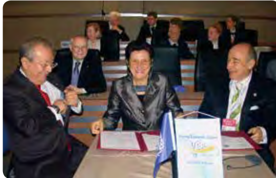
Memorandum of Understanding between Vienna Economic Forum and Marmara Foundation, Istanbul