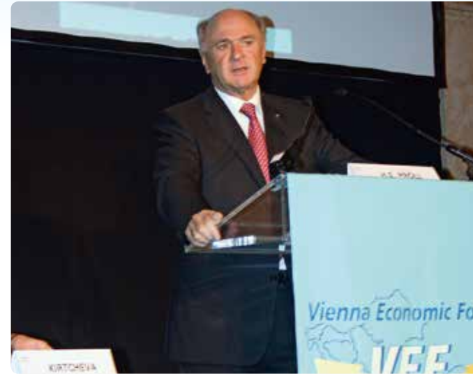
Welcome Statement of H.E. Dr. Erwin Pröll, Governor of the Province of Lower Austria