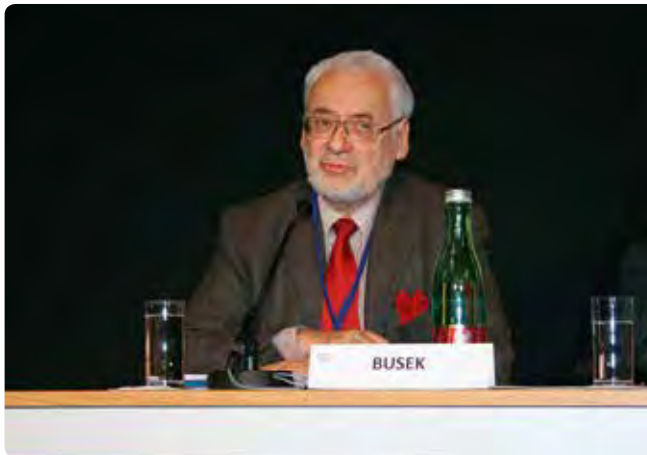
Dr. Erhard Busek, Former Vice Chancellor of the Republic of Austria, President of Vienna Economic Forum