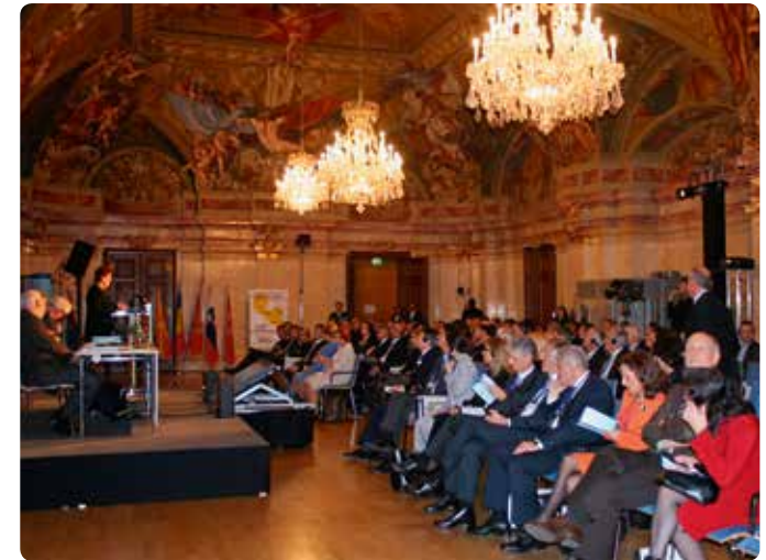
Official Opening of the 9th Vienna Economic Forum in Palais Niederösterreich

hosted by the Board of Vienna Economic Forum in the Federation of Austrian Industries, Founding Member of Vienna Economic Forum