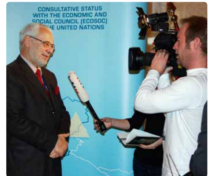
Interview with Dr. Erhard Busek, President of Vienna Economic Forum