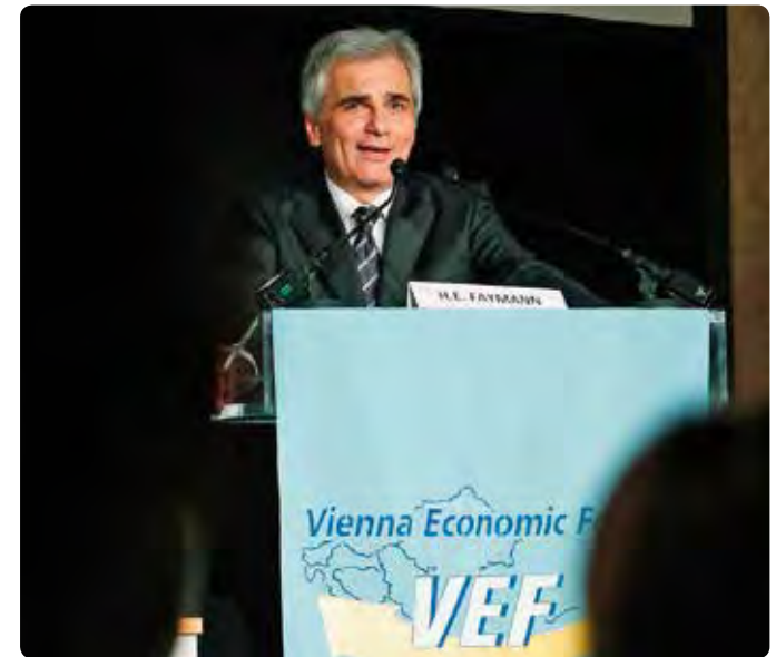
H.E. Mr. Werner Faymann, Federal Chancellor of the Republic of Austria, Patron of Vienna Economic Forum