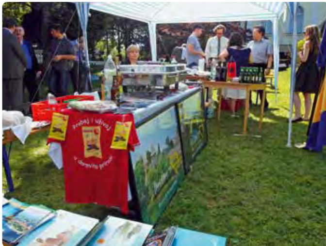
Specialities from Bosnia and Herzegovina