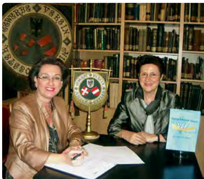
Memorandum of Understanding between Vienna Economic Forum and Österreichischer Gewerbe- verein, Vienna, Austria