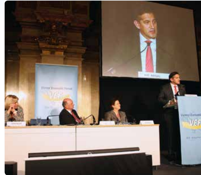
Main Statement of H.E. Mr. Besim Beqaj, Minister of Economic Development of Kosovo