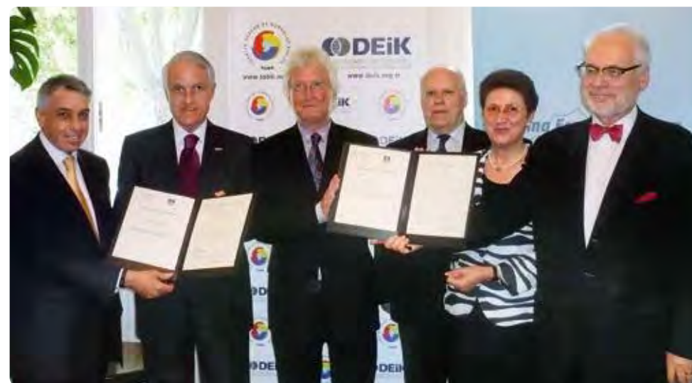
Memorandum of Understanding between Vienna Economic Forum and DEİK (Foreign Economic Relations Board of Turkey), Istanbul, Turkey