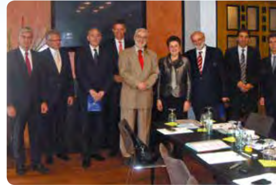
... at the Meetings of the Board of Vienna Economic Forum ...