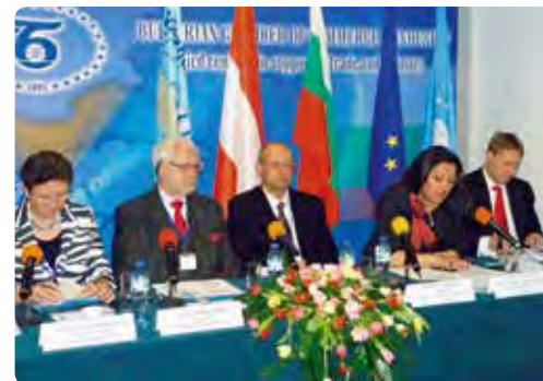
First Plenary Session