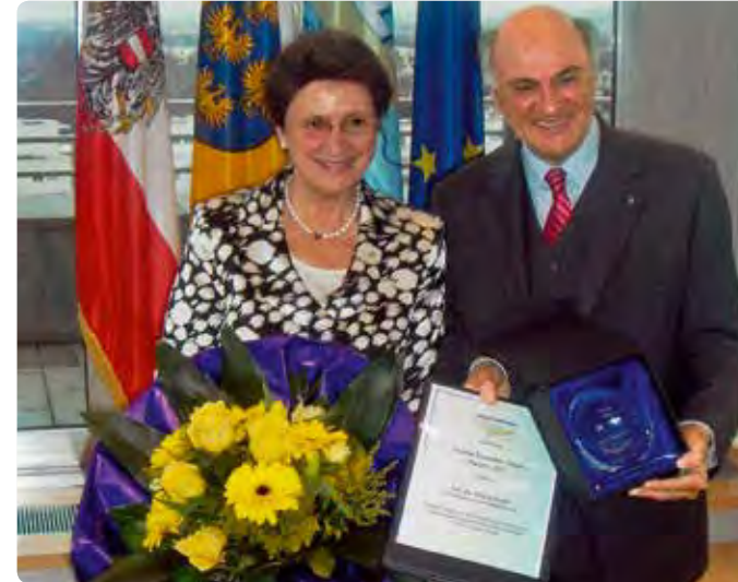
Award for his contribution to the economic development on the national and regional level in the countries of Vienna Economic Forum 2011 to H.E. Dr. Erwin Pröll, Governor of the Province of Lower Austria