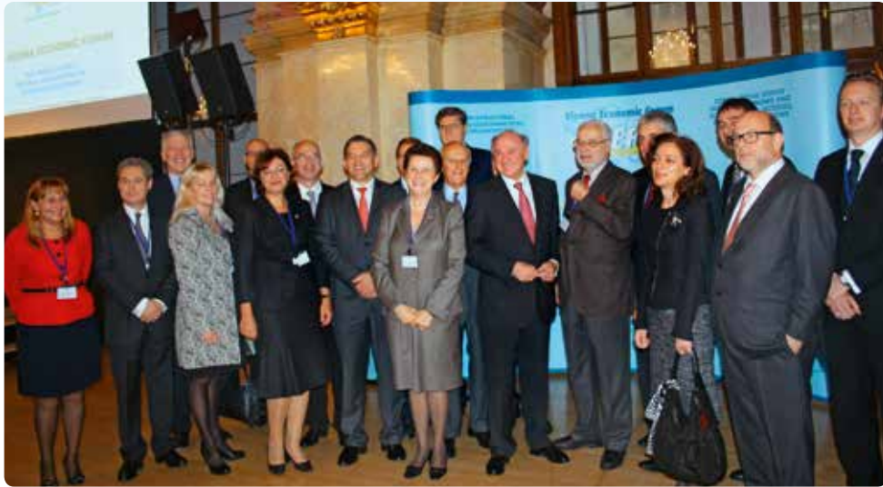
Family Foto with H.E. Dr. Erwin Pröll, Governor of the Province of Lower Austria, Members of the Board of Vienna Economic Forum and high-ranking participants of the 9th Vienna Economic Forum