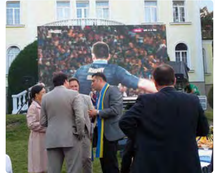
... discussing ...