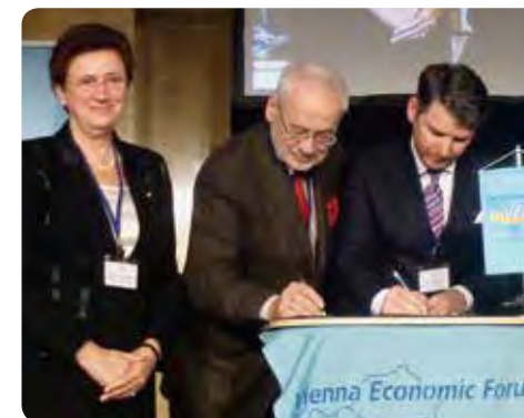
Memorandum of Understanding between Vienna Economic Forum and International Business and Diplomatic Exchange (IBDE), London, U.K.