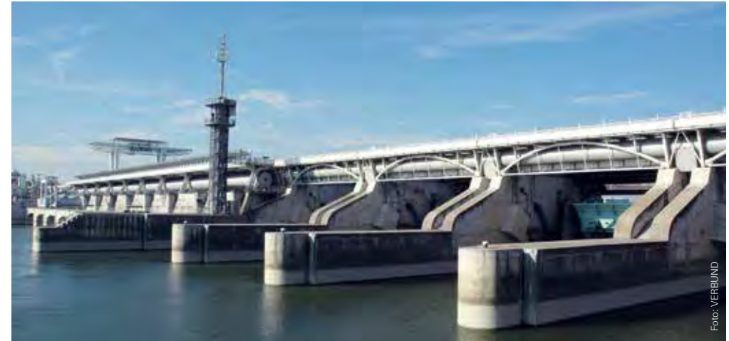
Run-of-River Plant Freudenau