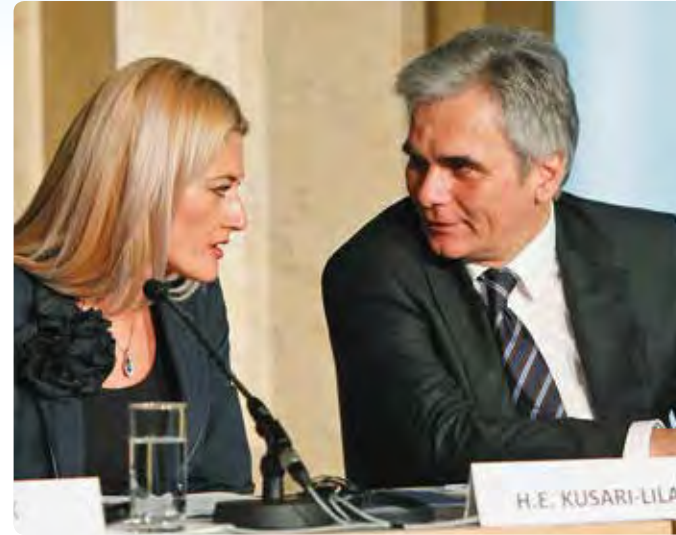
H.E. Ms. Mimoza Kusari-Lila, Deputy Prime Minister and Minister for Trade and Industry of Kosovo and H.E. Mr. Werner Faymann, Federal Chancellor of the Republic of Austria, Patron of Vienna Economic Forum