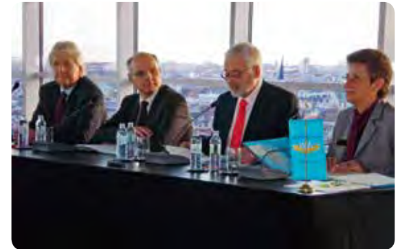
... or at the Annual General Assemblies of Vienna Economic Forum ...