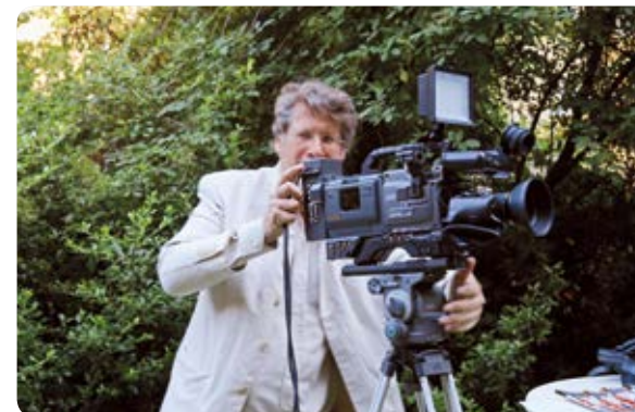
proud to have Monitor TV as Media Partner