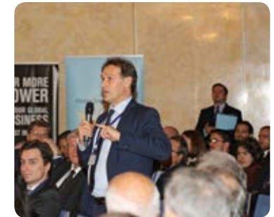
Questions and Answers