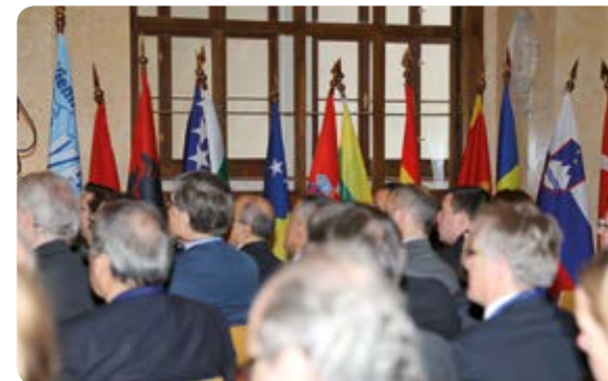
bringing the whole region together