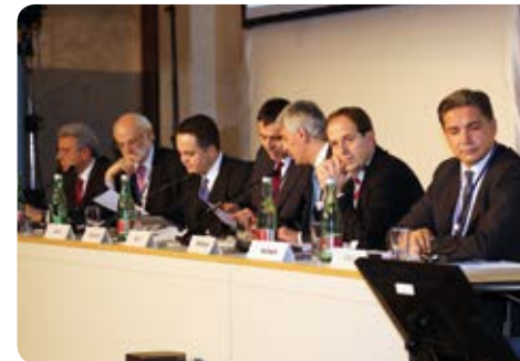
Vision for Europe