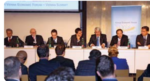
visions for the region