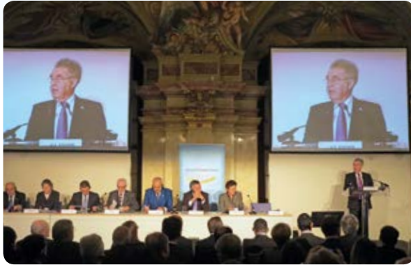
H.E. Dr. Heinz Fischer, Federal President of the Republic of Austria