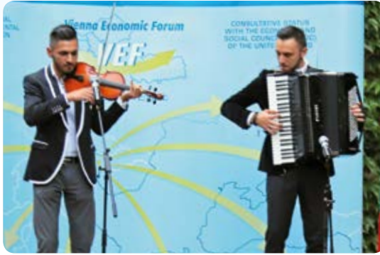
music from the balkans ...