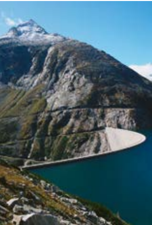
VERBUND’s power plant at Malta

VERBUND is Austria’s leading electricity company and one of the largest producers of electricity from hydropower in Europe.