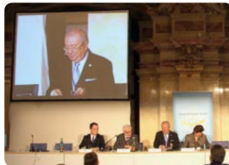
imaging the future