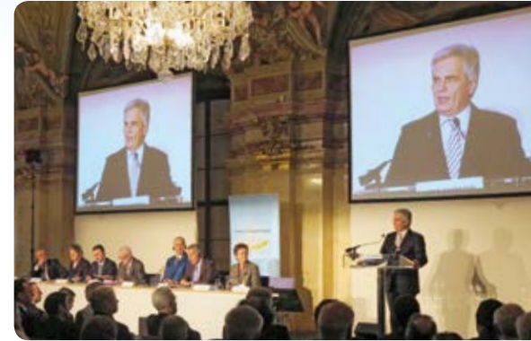
H.E. Werner Faymann, Federal Chancellor of the Republic of Austria