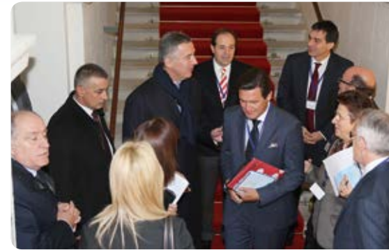
before the beginning

END OF THE 11 th Vienna Economic Forum – VIENNA SUMMIT 2014