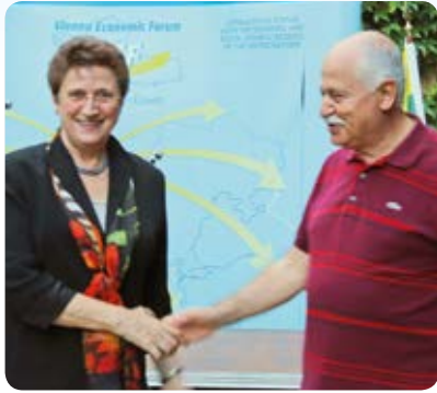
be together ...