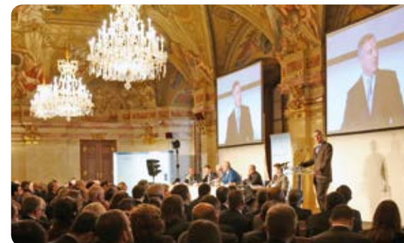
H.E. Mr. Milo Djukanovic, Prime Minister of Montenegro, Patron of Vienna Economic Forum