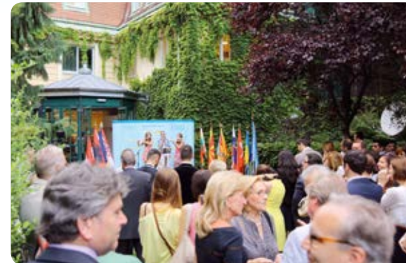
Cultural program for the soul