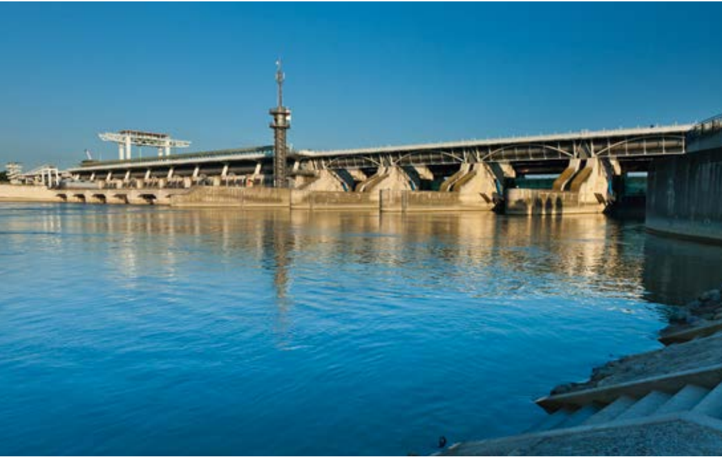
VERBUND’s run-of-the-river power plant of Freudenau