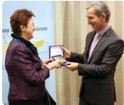
Decoration of merit for H.E. Iurie Leanca, Prime Minister of Moldova