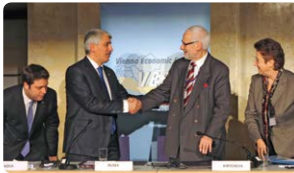
Memorandum of Understanding with the Anatolian Businessmen Association (ASKON)