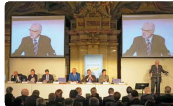
President Dr. Erhard Busek