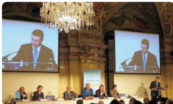
H.E. Mr. Nikola Gruevski, President of the Government of Macedonia, Patron of Vienna Economic Forum