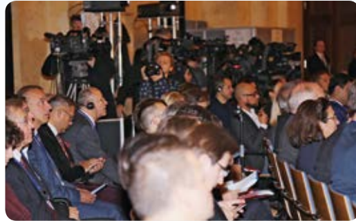
Opening speech by President Dr. Erhard Busek