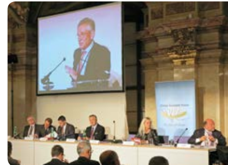
Presentation by Mag. Wilhelm Molterer, Vice-President, European Investment Bank (EIB)