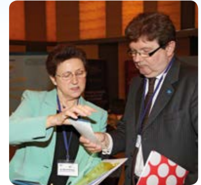
final preparations ...