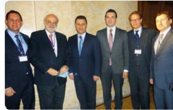
H.E. Prime Minister Nikola Gruevski and the Macedonian delegation with VEF-Board Members