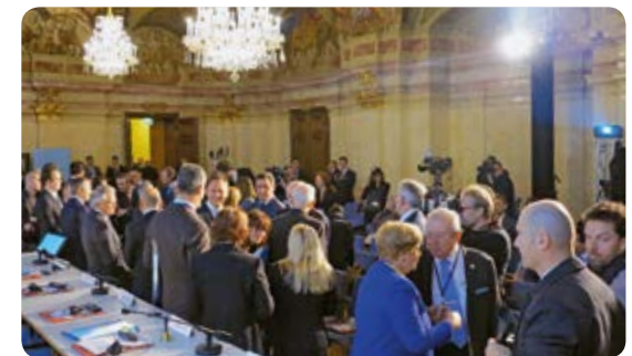
before the beginning