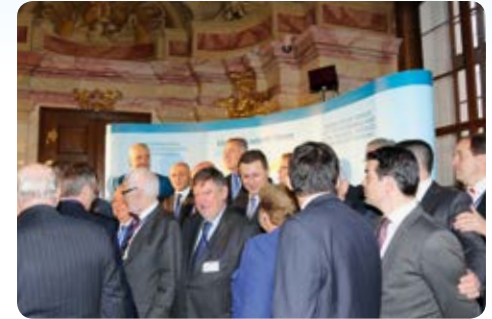
... is filling steadily