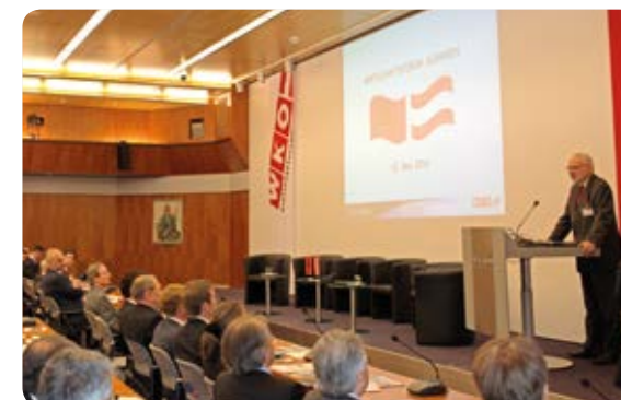
Dr. Erhard Busek, President of Vienna Economic Forum addressing the audience