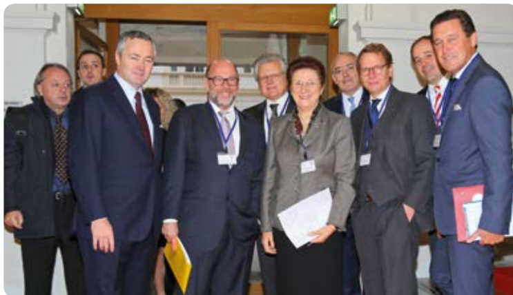
Members of the Board of Vienna Economic Forum