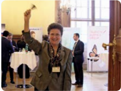
Time to start