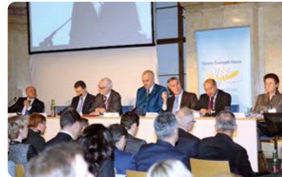
the Alpha Session