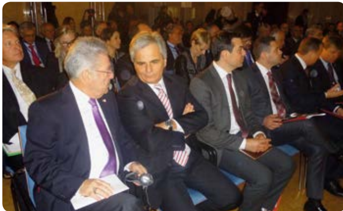
H.E. Dr. Heinz Fischer, Federal President of the Republic of Austria, H.E. Werner Faymann, Federal Chancellor of the Republic of Austria, Patron of Vienna Economic Forum and high ranking participants