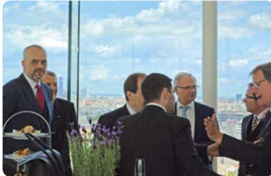
get together ...