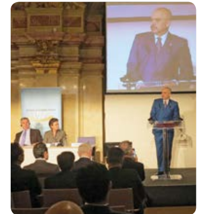
H.E. Mr. Edi Rama, Prime Minister of Albania, Patron of Vienna Economic Forum