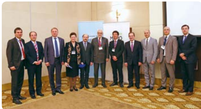
together for the future of Moldova