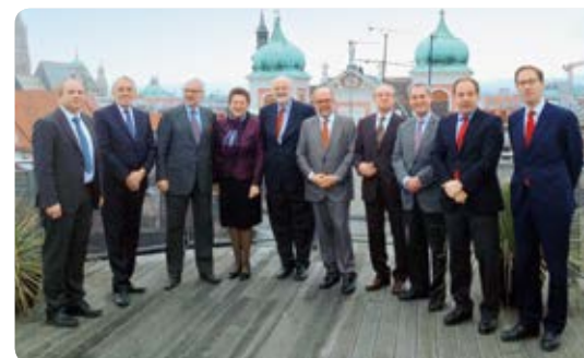
Members of the Board of Vienna Economic Forum