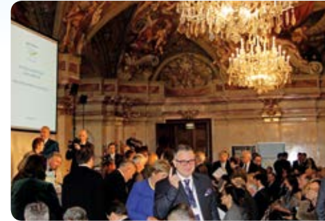
The conference hall ...