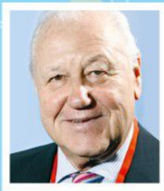
Dr. Karl BLECHA Former Federal Minister of Interior of the Republic of Austria Member of the Board of Vienna Economic Forum