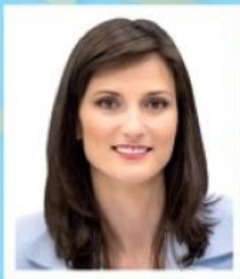
H.E. Ms. Mariya GABRIEL European Commissioner for Innovation, Research, Culture, Education and Youth