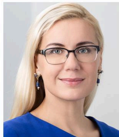
H.E. Ms. Kadri SIMSON European Commissioner for Energy