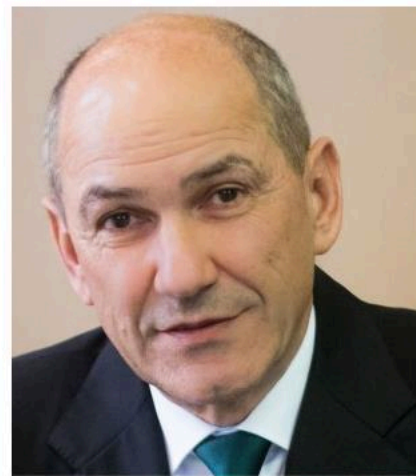
H.E. Mr. Janez JANŠA