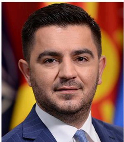
H.E. Mr. Kreshnik BEKTESHI

Minister of Economy of the Republic of North Macedonia Representative Member of the Patrons Committee of Vienna Economic Forum