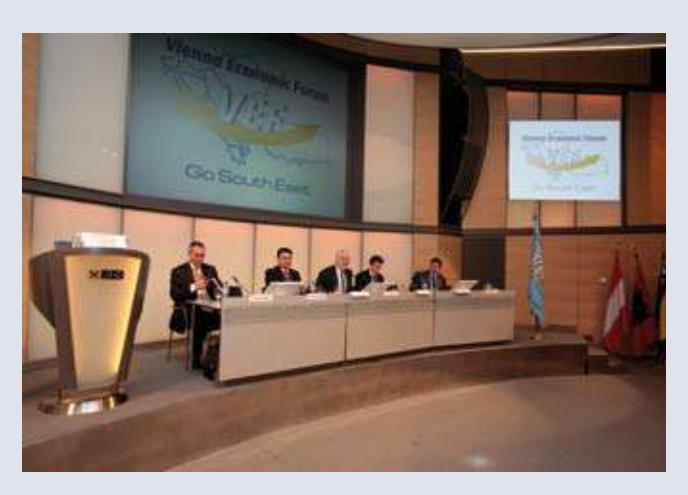
O and A Ministers Session in Plenary