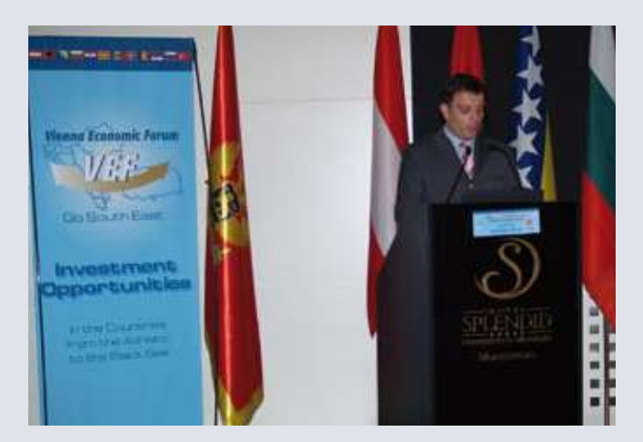
H.E. Mr. Predrag Nenezic, Minister of Tourism and Environmental Protection, Montenegro