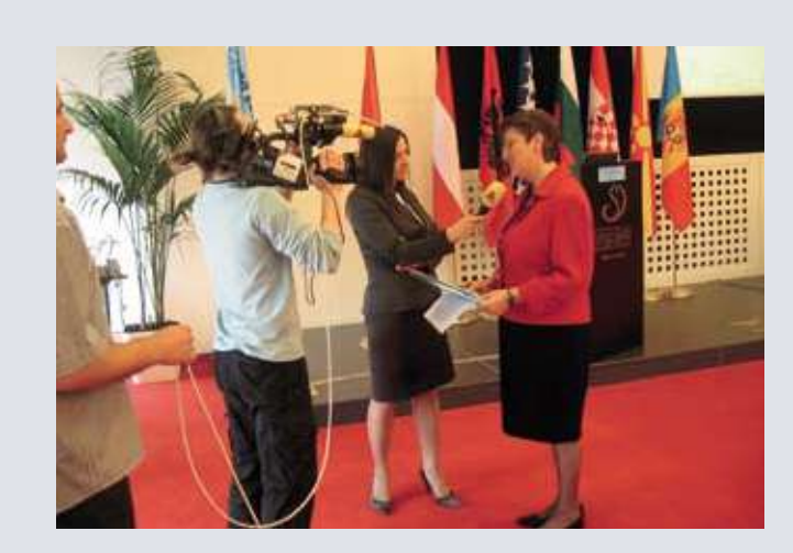
TV and media presence at the Forum