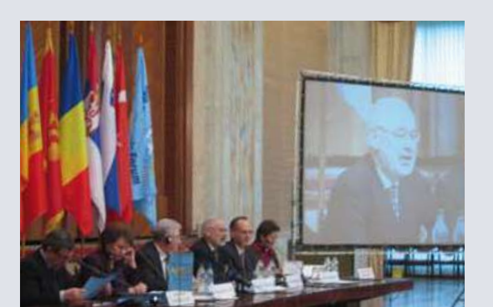
Panel First Plenary Session