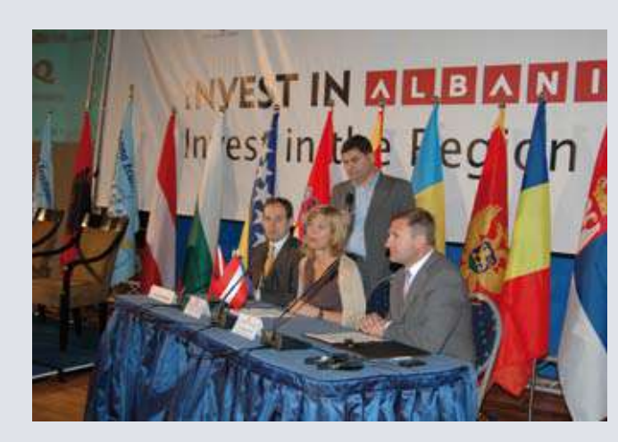
Ceremony of Signing of the of the Agreement "Technology Related Cooperation in the Health Sector" between Albania and Austria