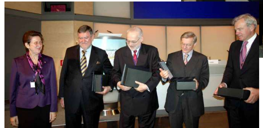
The winners have received the awards with great joy and have expressed their engagement for further activities of Vienna Economic Forum