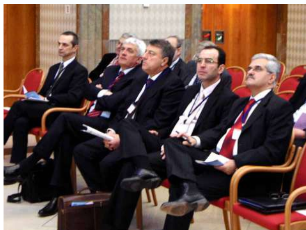
H.E. Amb. Radi Naidenov, Ambassador of Bulgaria, Ljubisa Krgovic, Governor, National Bank of Montenegro, Ardian Fullani, Governor, National Bank of Albania, Ivan Iskrov, Governor, National Bank of Bulgaria, Petar Goshev, Governor, National Bank of the of Macedonia