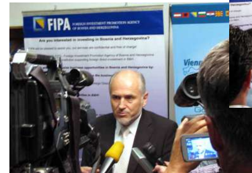
H.E. Ambassador Dr. Valentin Inzko, The High Representative and EU Special Representative in Bosnia and Herzegovina