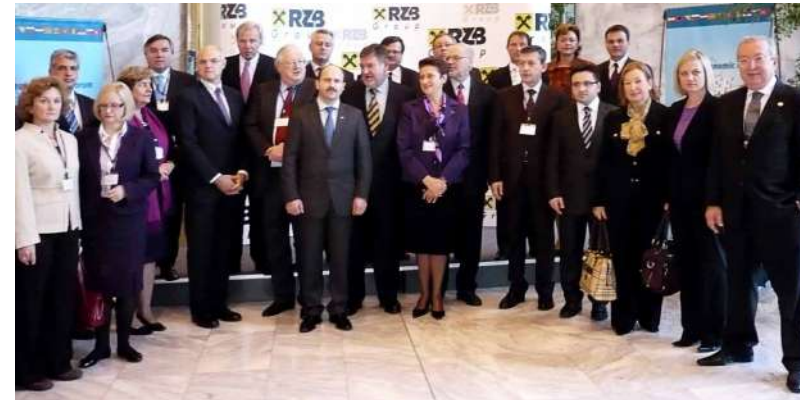
Family photo 6th VEF