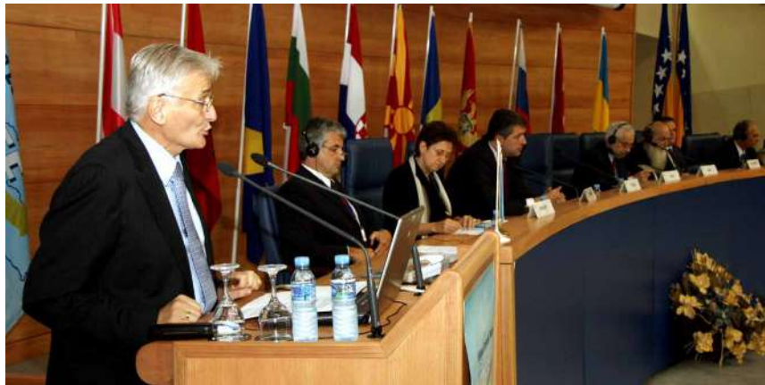
Welcome Address of H.E. Dr. Nikola Spiric, Chairman of the Council of Ministers of Bosnia and Herzegovina, Patron of Vienna Economic Forum