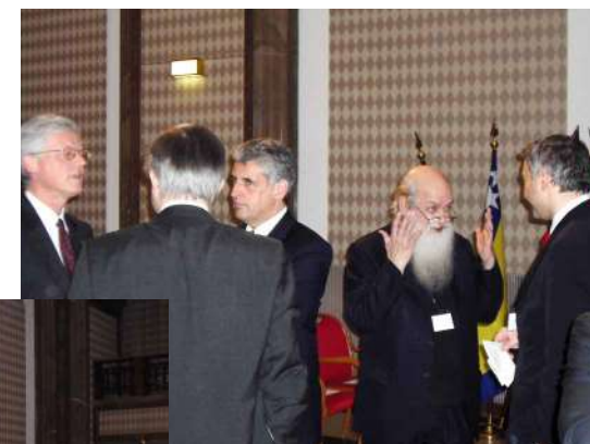
Discussion during the break