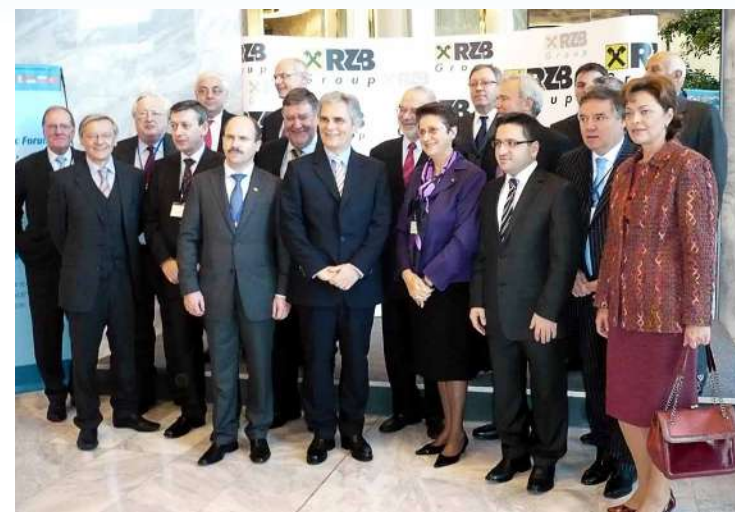
Family photo with H.E. Werner Faymann, Federal Chancellor of the Republic of Austria, Patron of Vienna Economic Forum