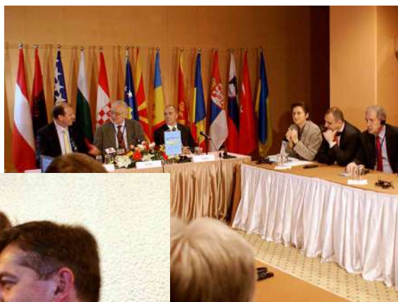
Investment opportunities discussion