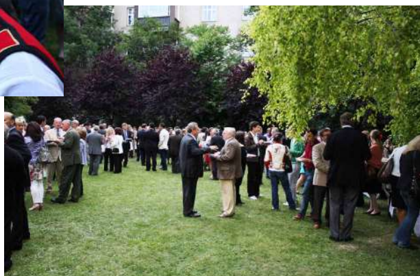
Regional contacts in a relaxed atmosphere