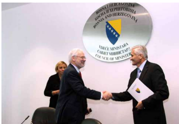
Dr. Erhard Busek, President of Vienna Economic Forum, H.E. Nikola Spiric, Chairman of the Council of Ministers of Bosnia and Herzegovina