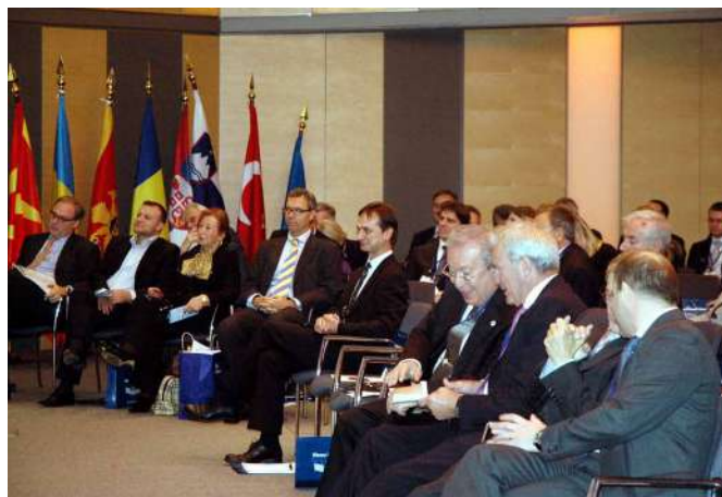
High interest among representatives of business, politics and diplomacy