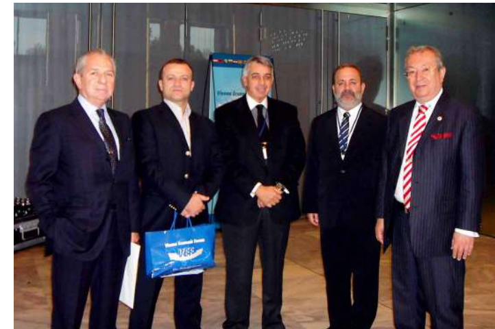
High-level delegation of Foreign Economic Relations Board of Turkey, (DEIK), at the signing of the Memorandum of Understanding with Vienna Economic Forum