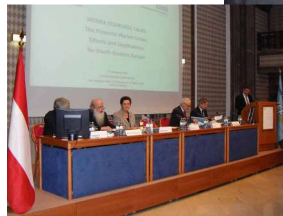
Attractiveness of SEE in Times of Crisis