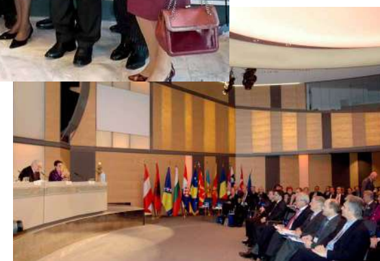
Challenges and Changes- 20 Years after the fall of the Iron Curtain