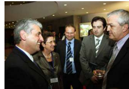
lively discussion during the break