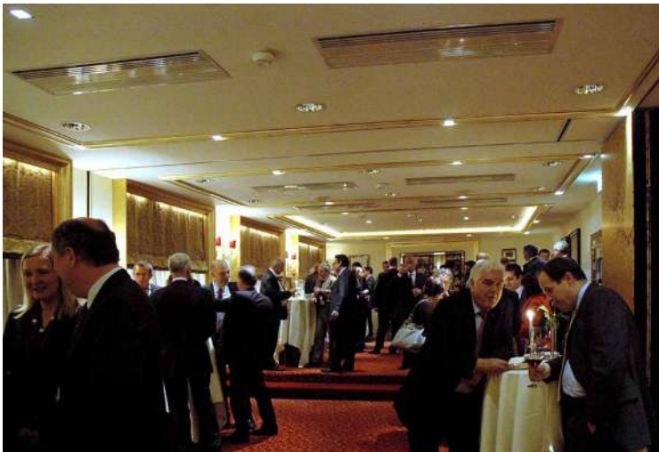
The discussion continues during the break