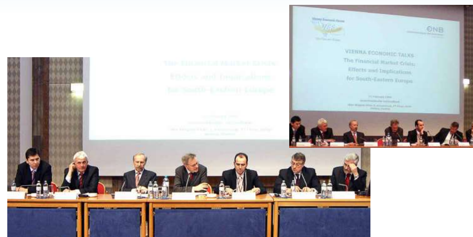
Members of the Governors Committee of Vienna Economic Forum