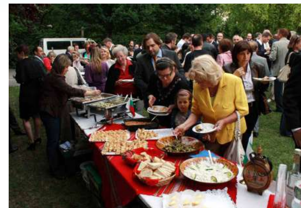
Delicacies from the region of the Vienna Economic Forum Countries