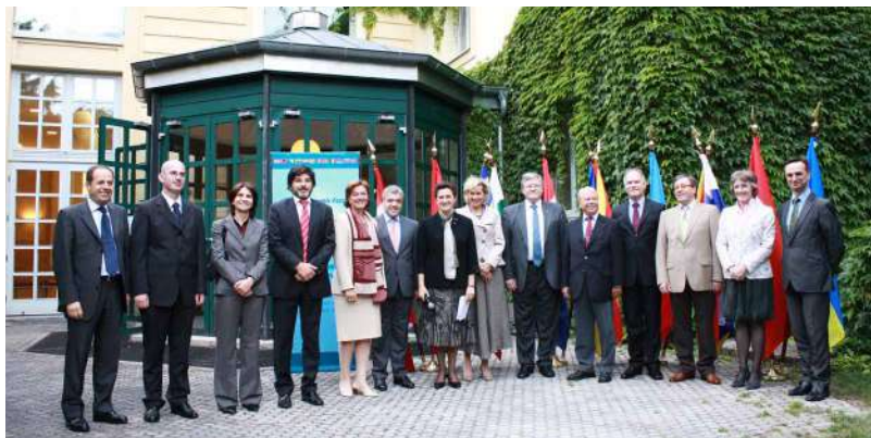
Members of the Ambassadors Committee together with the Members of VEF-Board

Meeting of Friends from the Adriatic to the Black Sea 12 June 2009, Diplomatic, Academy, Vienna