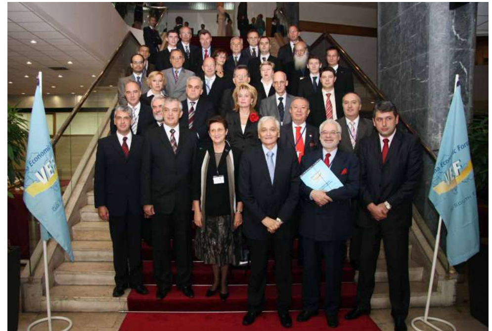
Family Foto with H.E. Nikola Spiric, Chairman of the Council of Ministers of Bosnia and Herzegovina, Patron of Vienna Economic Forum