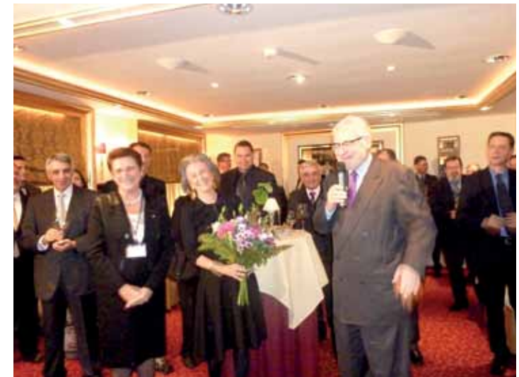
Address of President Dr. Erhard Busek on the occasion of the Welcome Cocktail in Hotel Sacher