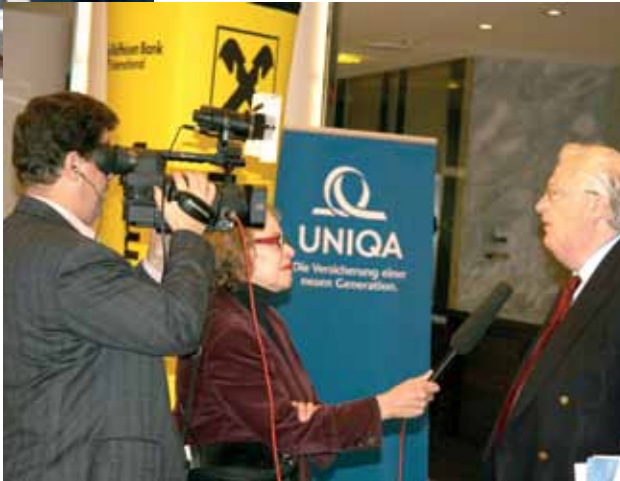
Interview with Dr. Josef Taus, First President and Honorary Member of Vienna Economic Forum