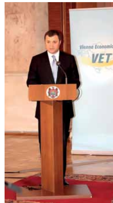
H.E. Mr. Vladimir Filat, Prime Minister of the Republic of Moldova

Possibilities for Bilateral Meetings, organised by Vienna Economic Forum (for VEF Members)