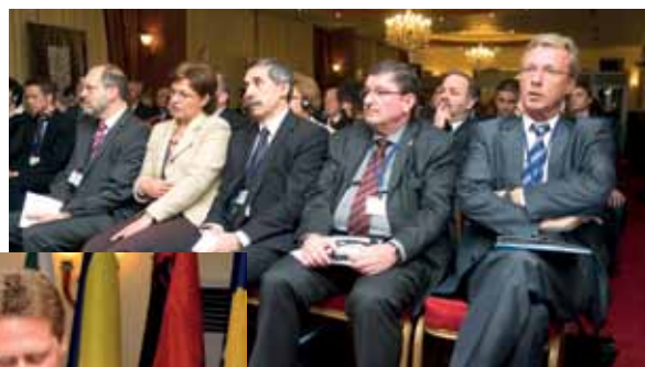
High-ranking speakers and audience