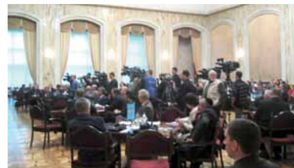
Audience and media representatives