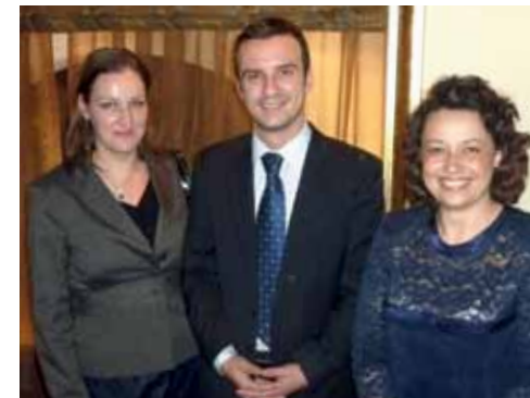
Team of Vienna Economic Forum