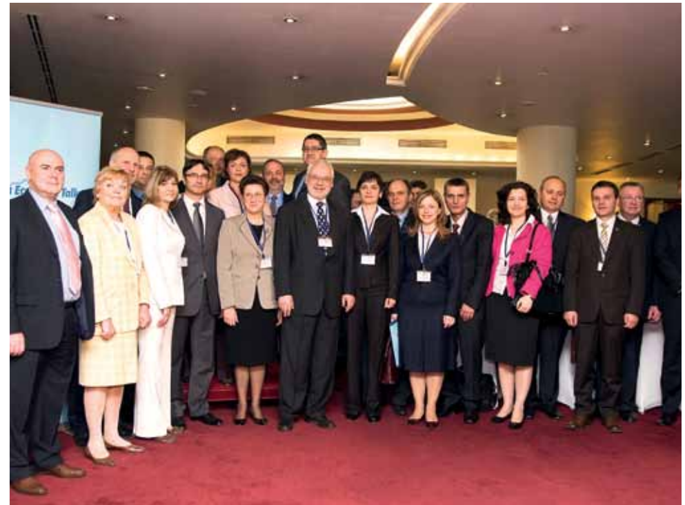
Under the Patronance of the Prime Minister of the Republic of Bulgaria and Patron of Vienna Economic Forum H.E. Mr. Boyko BORISSOV