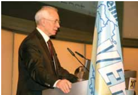
H.E. Mr. Mykola Azarov, Prime Minister of Ukraine