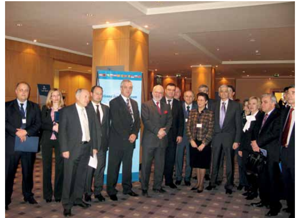
with a High Ranking Delegation, led by H.E. Dr. Nikola SPIRIC Chairman of the Council of Ministers of Bosnia and Herzegovina