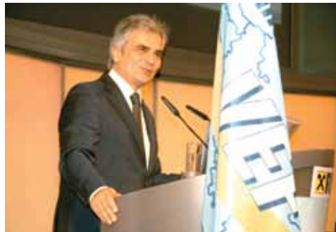
H.E. Mr. Werner Faymann, Federal Chancellor of the Republic of Austria, Patron of Vienna Economic Forum