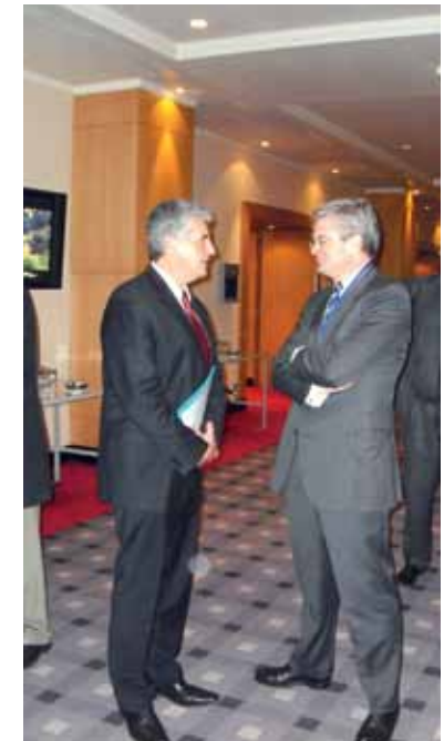
Lively discussions during the break