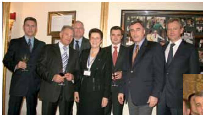
High-ranking guests from the region of Vienna Economic Forum in Hotel Sacher