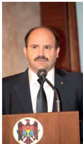
H.E. Mr. Valeriu Lazar, Deputy Prime Minister of the Republic of Moldova