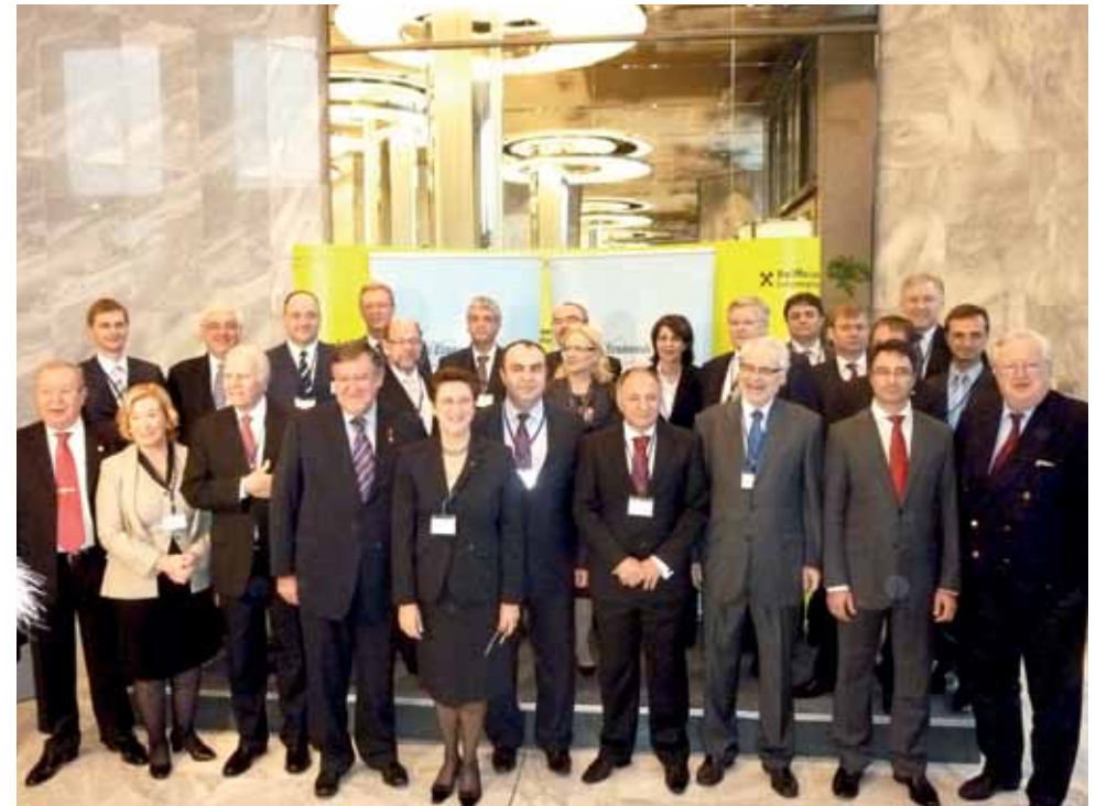
Board of Vienna Economic Forum with the high representatives of politics and economy of the region of South-Eastern Europe

8–9 November 2010, Raiffeisen Zentral Bank, Vienna, Austria