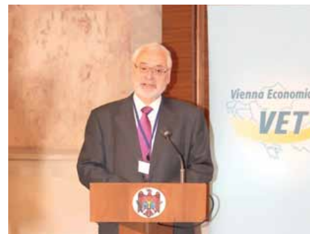
Dr. Erhard Busek, President of Vienna Economic Forum