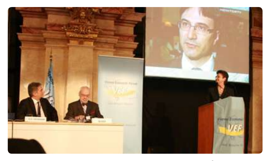
Official Opening of the 8<sup>th</sup> Vienna Economic Forum