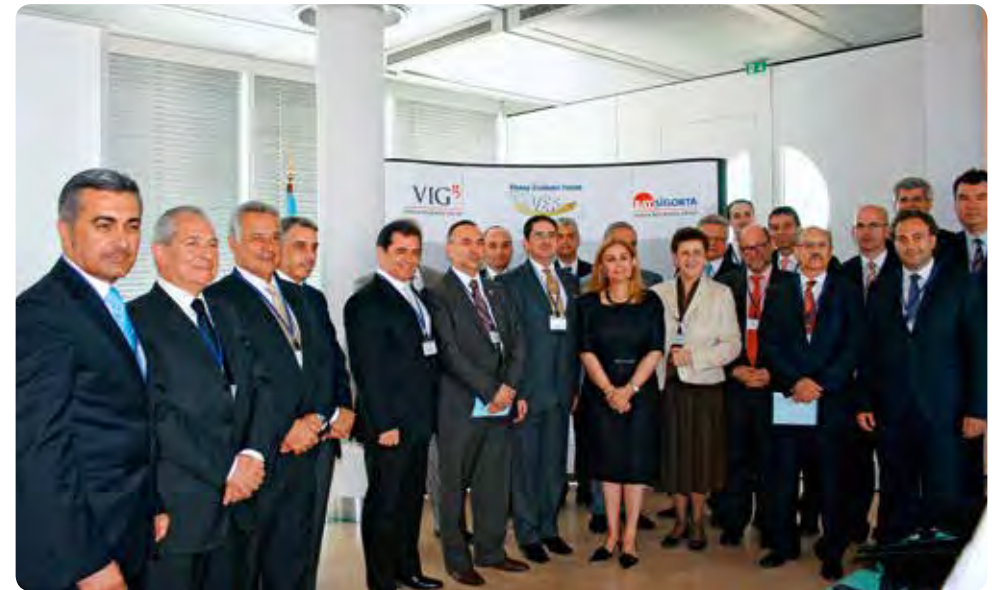
Family Foto in Ringturm with high-ranking representatives of the Turkish economy and Members of the Board of Vienna Economic Forum

in cooperation with Vienna Insurance Group, Ray Sigorta A.S. and Verbund AG