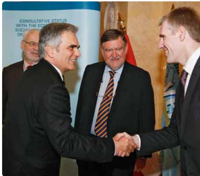
H.E. Mr. Werner Faymann, Federal Chancellor of the Republic of Austria, Patron of Vienna Economic Forum welcoming H.E. Mr. Igor Luksic, Prime Minister of Montenegro, Patron of Vienna Economic Forum