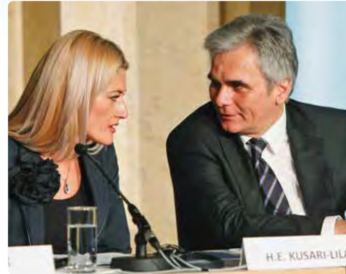
H.E. Ms. Mimoza Kusari-Lila, Deputy Prime Minister and Minister for Trade and Industry of Kosovo and H.E. Mr. Werner Faymann, Federal Chancellor of the Republic of Austria, Patron of Vienna Economic Forum