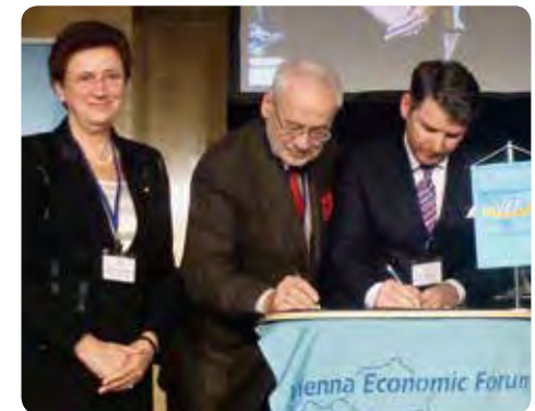
Memorandum of Understanding between Vienna Economic Forum and International Business and Diplomatic Exchange (IBDE), London, U.K.