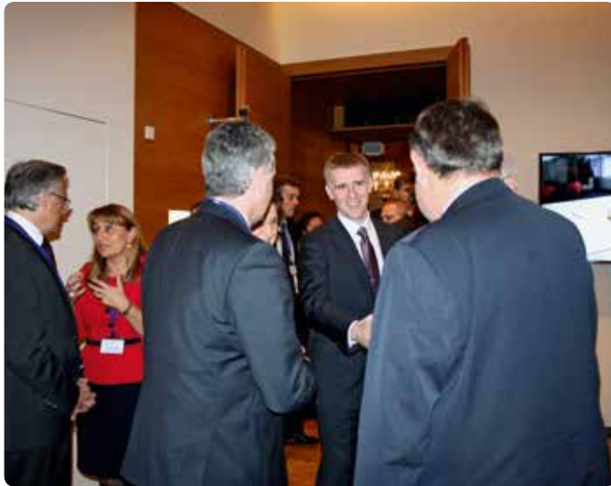
Welcome of H.E. Mr. Igor Luksic, Prime Minister of Montenegro, Patron of Vienna Economic Forum