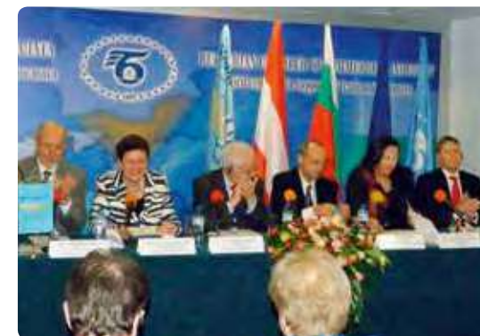
The Chair of the First Plenary Session