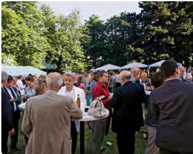
... and enjoying ...