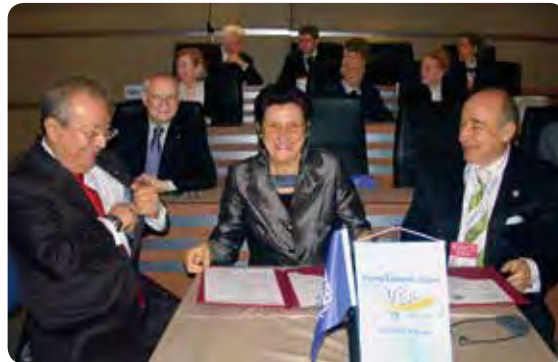
Memorandum of Understanding between Vienna Economic Forum and Marmara Foundation, Istanbul