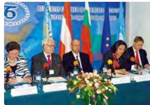
First Plenary Session