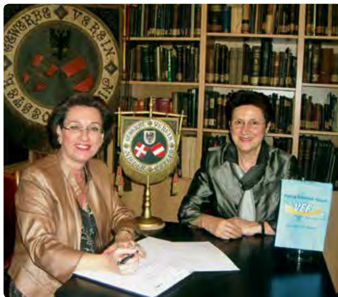
Memorandum of Understanding between Vienna Economic Forum and Österreichischer Gewerbeverein, Vienna, Austria