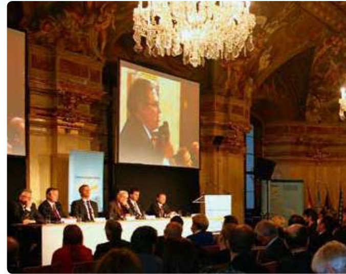
Third Plenary Session „The Danube Region – European Challenges. Energy, Transport, Logistics. Social Responsibility“