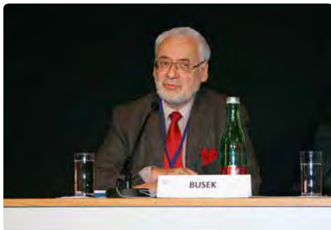
Dr. Erhard Busek, Former Vice Chancellor of the Republic of Austria, President of Vienna Economic Forum