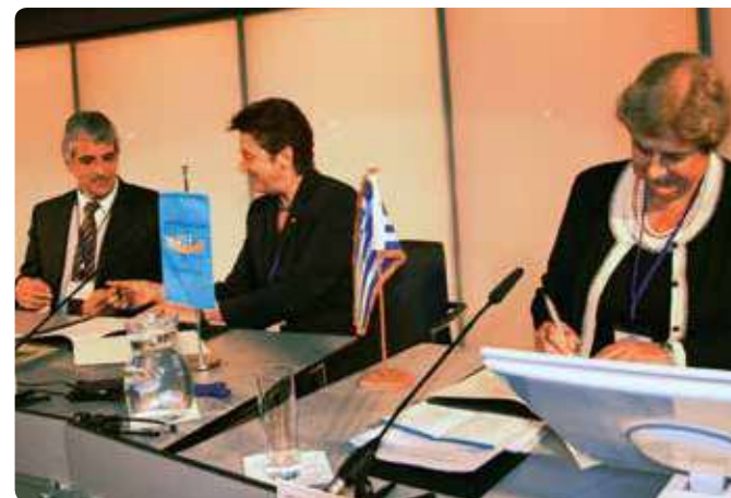
Memorandum of Understanding between Vienna Economic Forum and Biopolitics International Organisation (B.I.O.), Athens, Greece