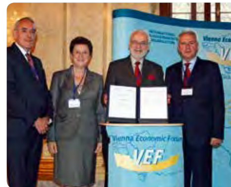
Memorandum of Understanding between Vienna Economic Forum and Confederation of the Employers and Industrialists in Bulgaria (CEIBG), Sofia, Bulgaria