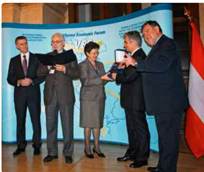
Vienna Economic Forum Award 2012 to H.E. Mr. Werner Faymann, Federal Chancellor of the Republic of Austria and Patron of Vienna Economic Forum

H.E. Ms. Mimoza Kusari-Lila, Deputy Prime Minister and Minister for Trade and Industry of Kosovo