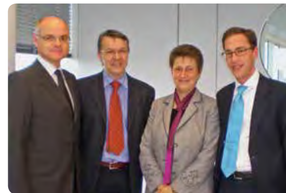
... the Vienna Economic Forum Family is working and thinking together about the further successful development of Vienna Economic Forum