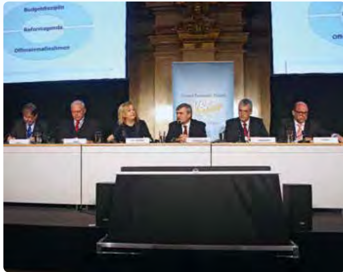
Second Plenary Session „Growth and Finance – Motors in New Frameworks. Infrastructure and Innovative Locations. The Fresh Wind“ with H.E. Dr. Maria Fekter, Federal Minister of Finance of the Republic of Austria