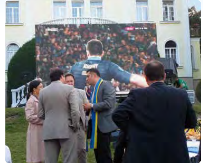
... discussing ...