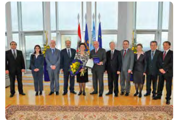
Festivity for H.E. Dr. Erwin Pröll, Governor of the Province of Lower Austria on the occasion of the Vienna Economic Forum Award 2011 – ceremony with the Ambassadors Committee of Vienna Economic Forum