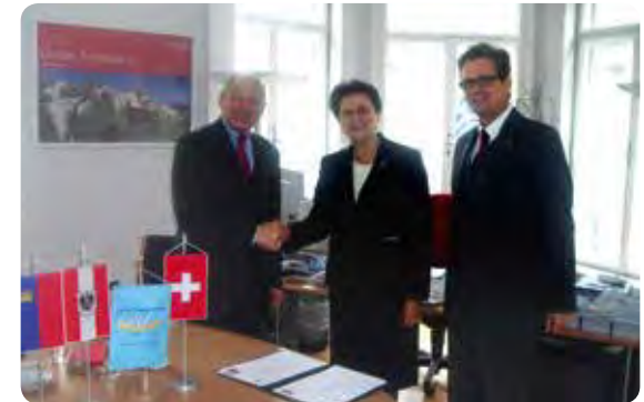
Memorandum of Understanding between Vienna Economic Forum and Handelskammer Schweiz-Österreich-Liechtenstein