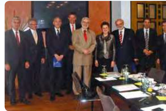
... at the Meetings of the Board of Vienna Economic Forum ...