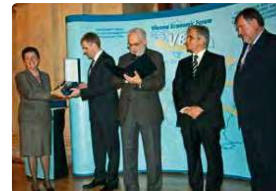
Vienna Economic Forum Award 2012 to H.E. Mr. Igor Luksic, Prime Minister of Montenegro, Patron of Vienna Economic Forum