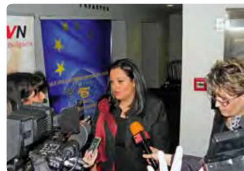
H.E. Ms. Lilyana Pavlova, Minister of Labour and Social Policy of the Republic of Bulgaria