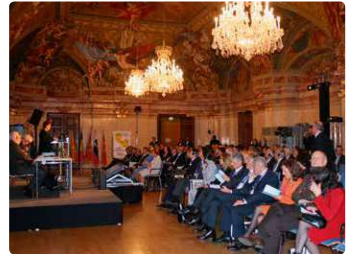
Official Opening of the 9th Vienna Economic Forum in Palais Niederösterreich

hosted by the Board of Vienna Economic Forum in the Federation of Austrian Industries, Founding Member of Vienna Economic Forum