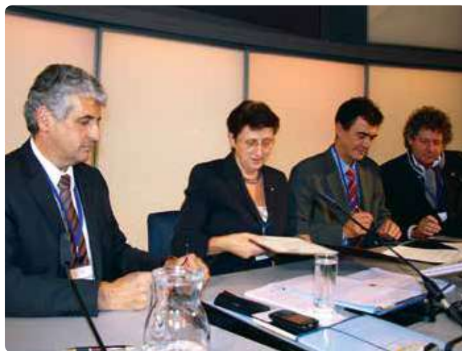
Memorandum of Understanding between Vienna Economic Forum and Business Advisory Council for South-Eastern Europe, Thessaloniki, Greece