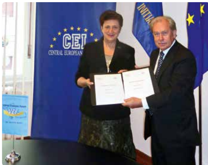
Memorandum of Understanding between Vienna Economic Forum and Central European Initiative (CEI), Trieste, Italy