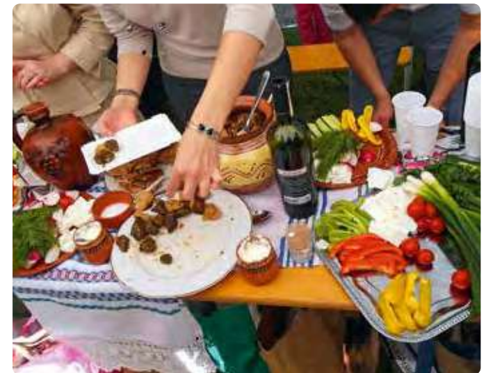
... and culinary pleasure ...