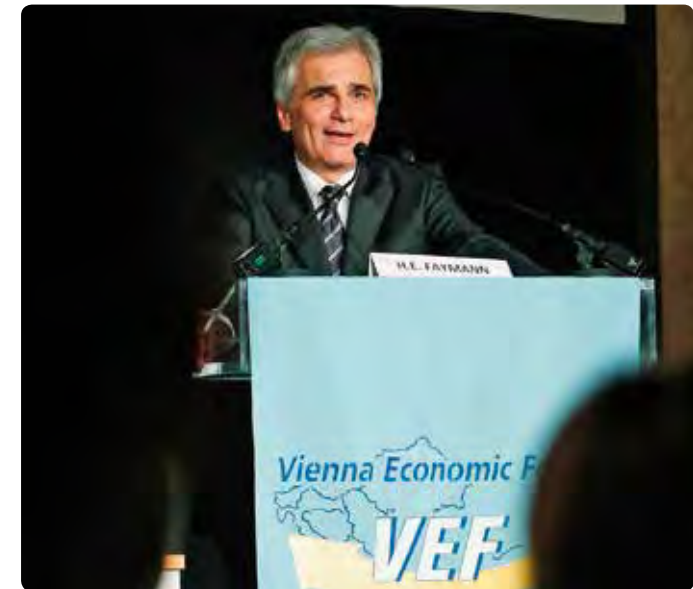
H.E. Mr. Werner Faymann, Federal Chancellor of the Republic of Austria, Patron of Vienna Economic Forum