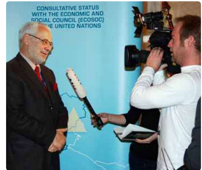
Interview with Dr. Erhard Busek, President of Vienna Economic Forum