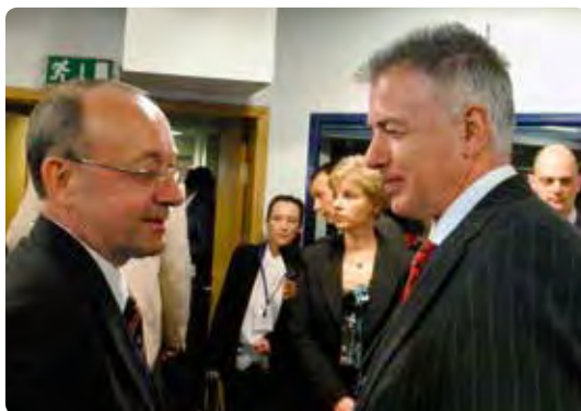
Intensive Talks during Vienna Economic Talks – Sofia Meeting 2012