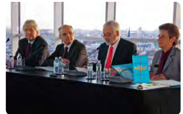
... or at the Annual General Assemblies of Vienna Economic Forum ...