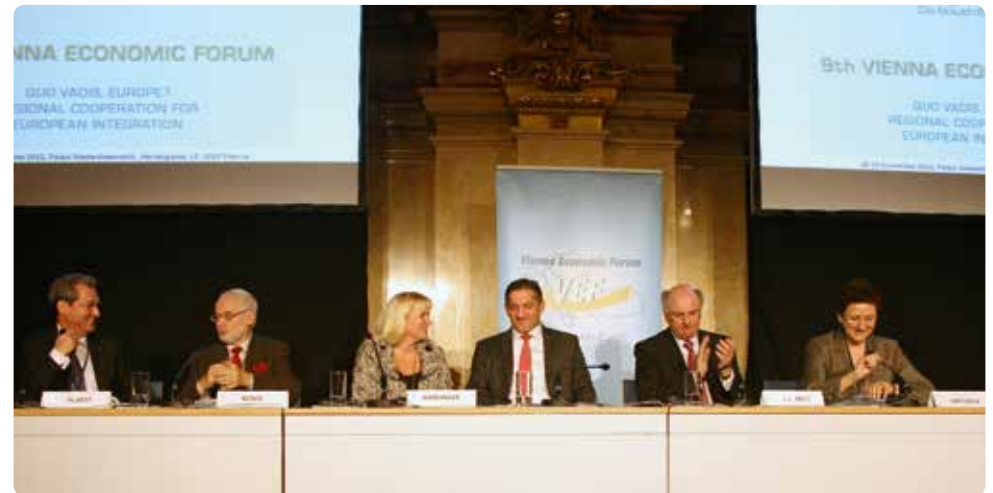
First Opening Plenary Session „Quo vadis, Europe? Regional Cooperation for European Integration“