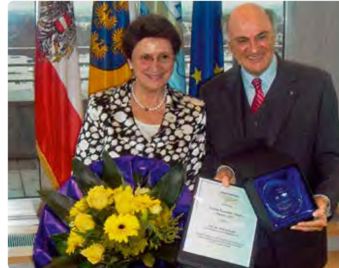
Award for his contribution to the economic development on the national and regional level in the countries of Vienna Economic Forum 2011 to H.E. Dr. Erwin Pröll, Governor of the Province of Lower Austria