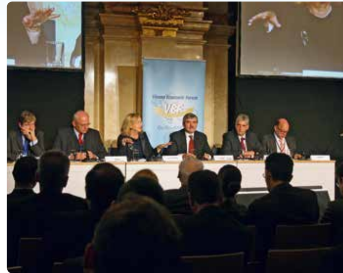
Main Statement of H.E. Dr. Maria Fekter, Federal Minister of Finance of the Republic of Austria