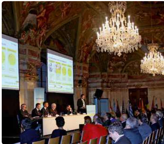
Third Plenary Session „The Danube Region – European Challenges. Energy, Transport, Logistics. Social Responsibility“