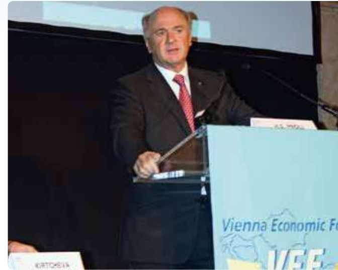
Welcome Statement of H.E. Dr. Erwin Pröll, Governor of the Province of Lower Austria