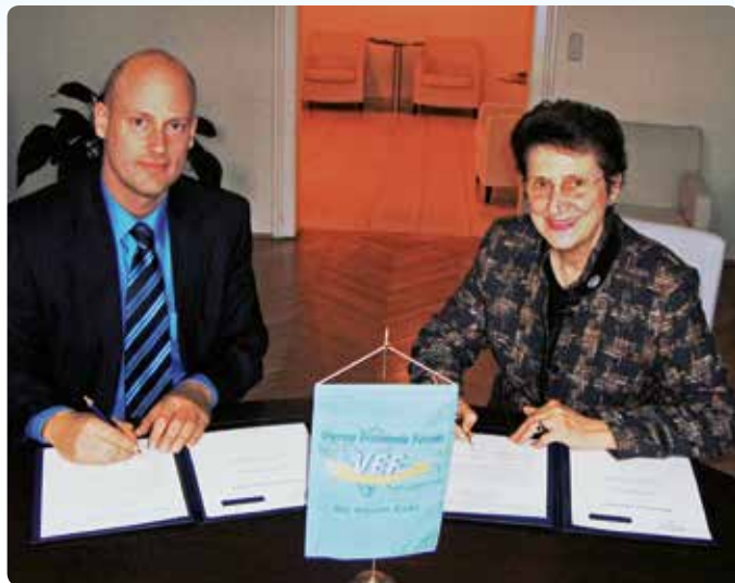
Memorandum of Understanding between Vienna Economic Forum and EastEuroCo Executive Search Group Ltd., Budapest, Hungary