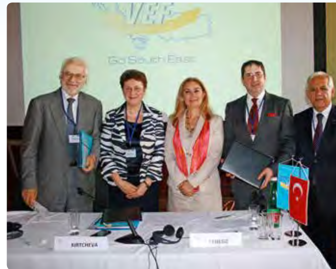
Memorandum of Understanding between Vienna Economic Forum and TURKONFED Turkish Enterprise and Business Confederation, Istanbul, Turkey