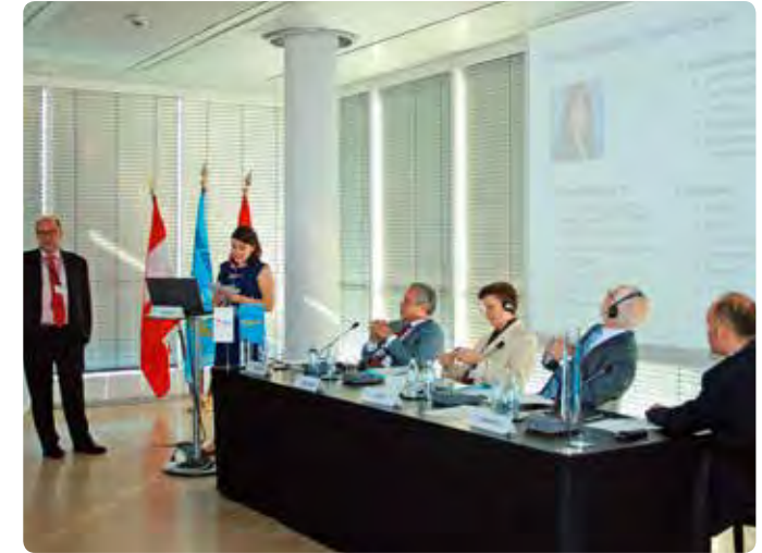
Presentation of Lansky, Ganzger + Partner Attorneys and their activities in Turkey