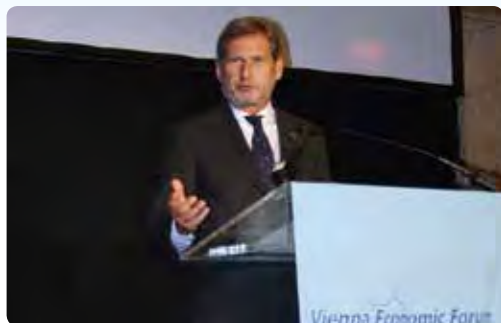
H.E. Dr. Johannes Hahn, European Commissioner for Regional Policy