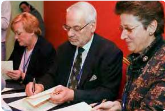
Memorandum of Understanding between Vienna Economic Forum and EUROPEAN CENTER FOR ENVIRONMENTAL ECONOMY (ECEE), Sofia