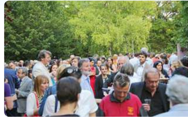
... how much the people of the region have in common