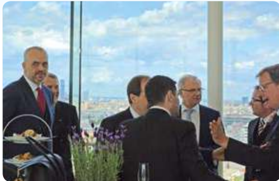
get together ...