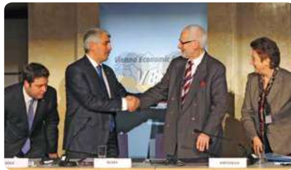
Memorandum of Understanding with the Anatolian Businessmen Association (ASKON)