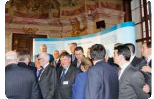
... is filling steadily