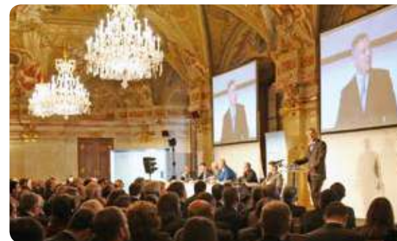
H.E. Mr. Milo Djukanovic, Prime Minister of Montenegro, Patron of Vienna Economic Forum