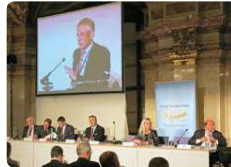
Presentation by Mag. Wilhelm Molterer, Vice-President, European Investment Bank (EIB)