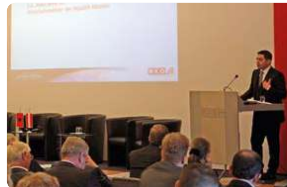
Statement of H.E. Mr. Arben Ahmetaj, Minister of Economic Development, Trade and Entrepreneurship of Albania, Member of the Vienna Economic Forum Committee of Ministers of Economy