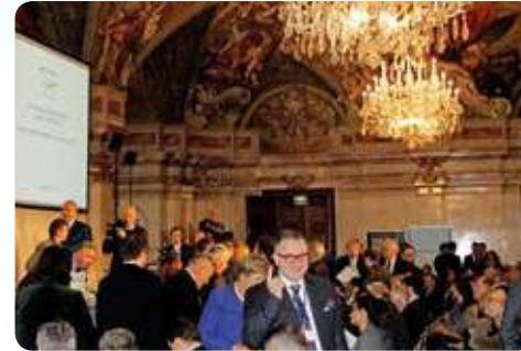
The conference hall ...