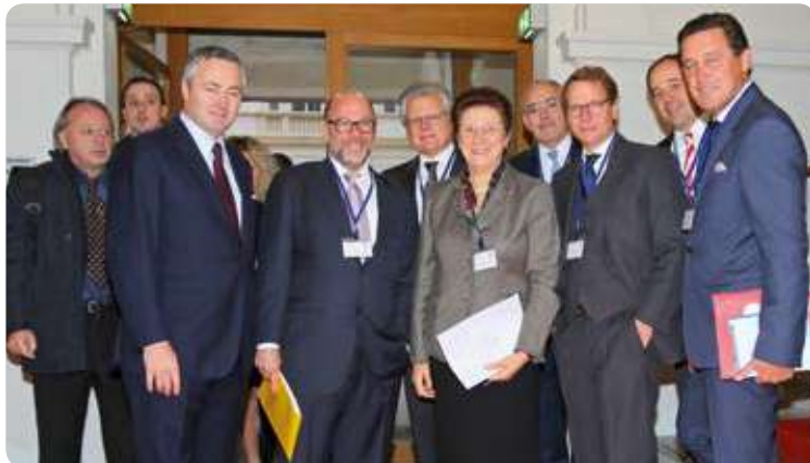
Members of th Board of Vienna Economic Forum