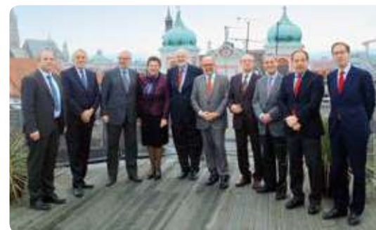
Members of the Board of Vienna Economic Forum