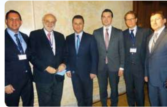
H.E. Prime Minister Nikola Gruevski and the Macedonian delegation with VEF-Board Members