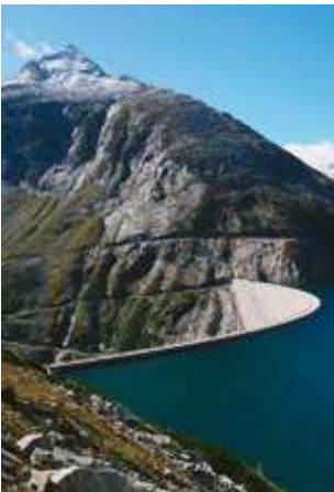
VERBUND's power plant at Malta

VERBUND is Austria's leading electricity company and one of the largest producers of electricity from hydropower in Europe.