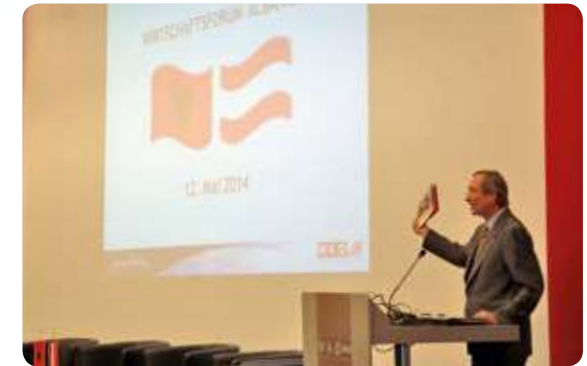
Welcome address by Dr. Christoph Leitl, President, Austrian Federal Economic Chamber, Member of the Vienna Economic Forum Committee of Presidents of Economic Chambers