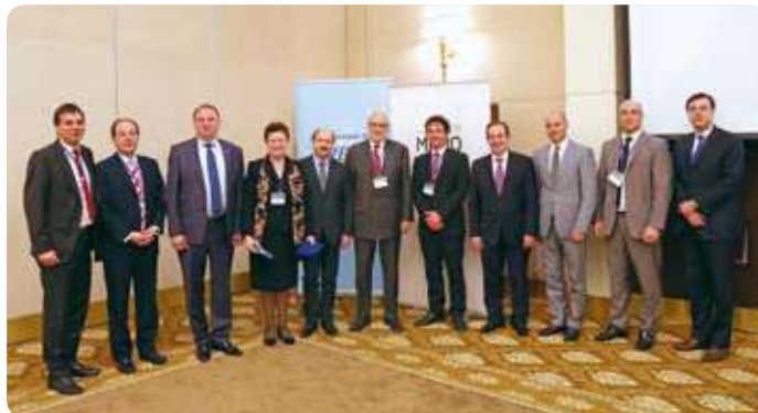
together for the future of Moldova