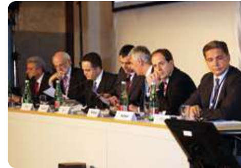
Vision for Europe