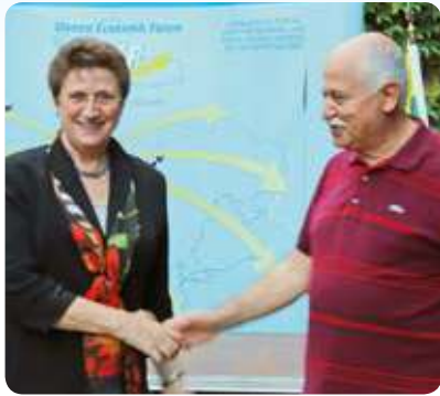
be together ...