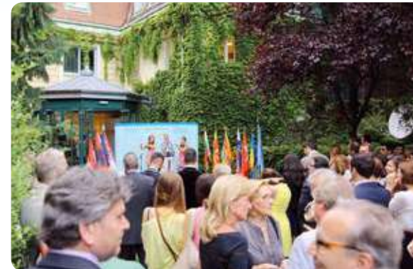
Cultural program for the soul