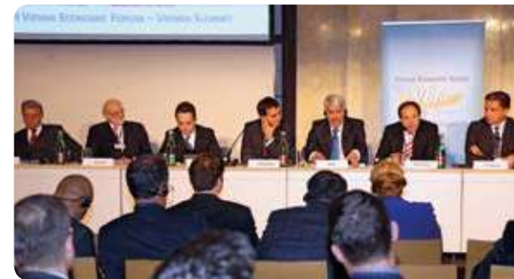
visions for the region