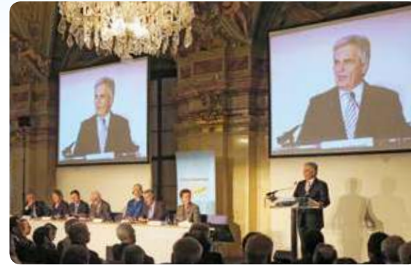
H.E. Werner Faymann, Federal Chancellor of the Republic of Austria