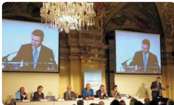
H.E. Mr. Nikola Gruevski, President of the Government of Macedonia, Patron of Vienna Economic Forum