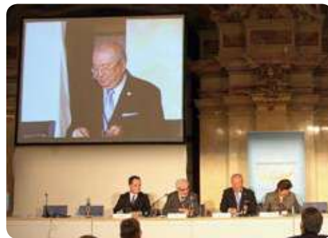
imaging the future