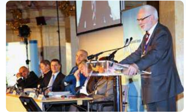
Opening speech by President Dr. Erhard Busek