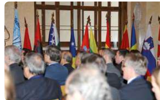
bringing the whole region together