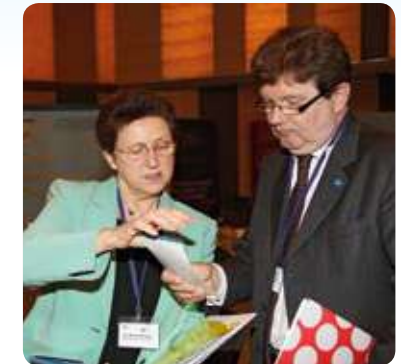
final preparations ...