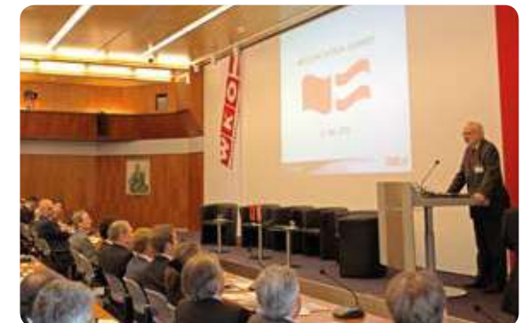
Dr. Erhard Busek, President of Vienna Economic Forum addressing the audience