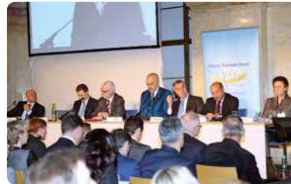
the Alpha Session