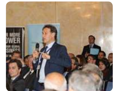
Questions and Answers