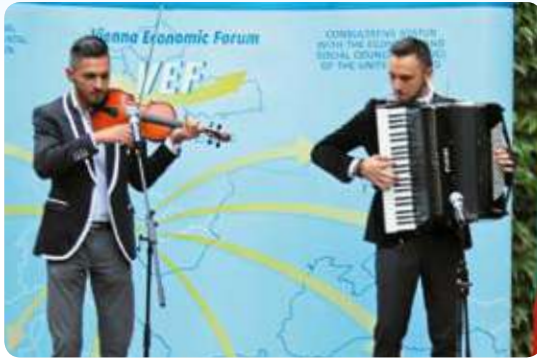
music from the balkans ...