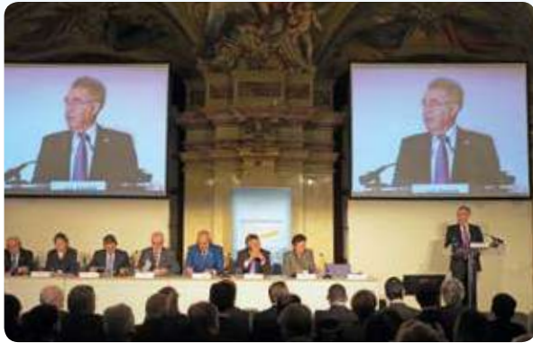
H.E. Dr. Heinz Fischer, Federal President of the Republic of Austria