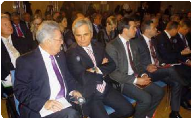
H.E. Dr. Heinz Fischer, Federal President of the Republic of Austria, H.E. Werner Faymann, Federal Chancellor of the Republic of Austria, Patron of Vienna Economic Forum and high ranking participants