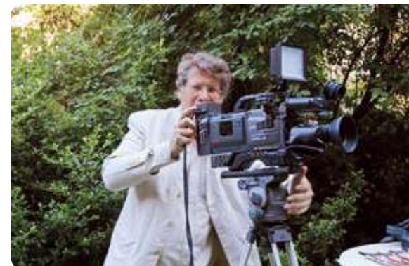
proud to have Monitor TV as Media Partner