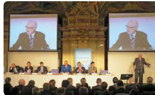
President Dr. Erhard Busek