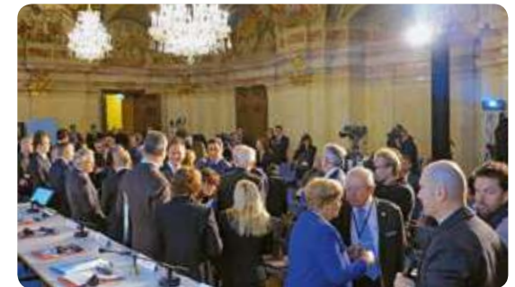
before the beginning