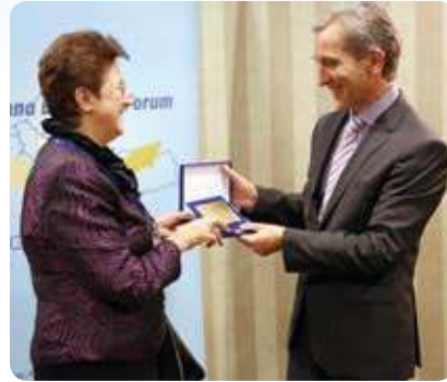
Decoration of merit for H.E. Iurie Leanca, Prime Minister of Moldova