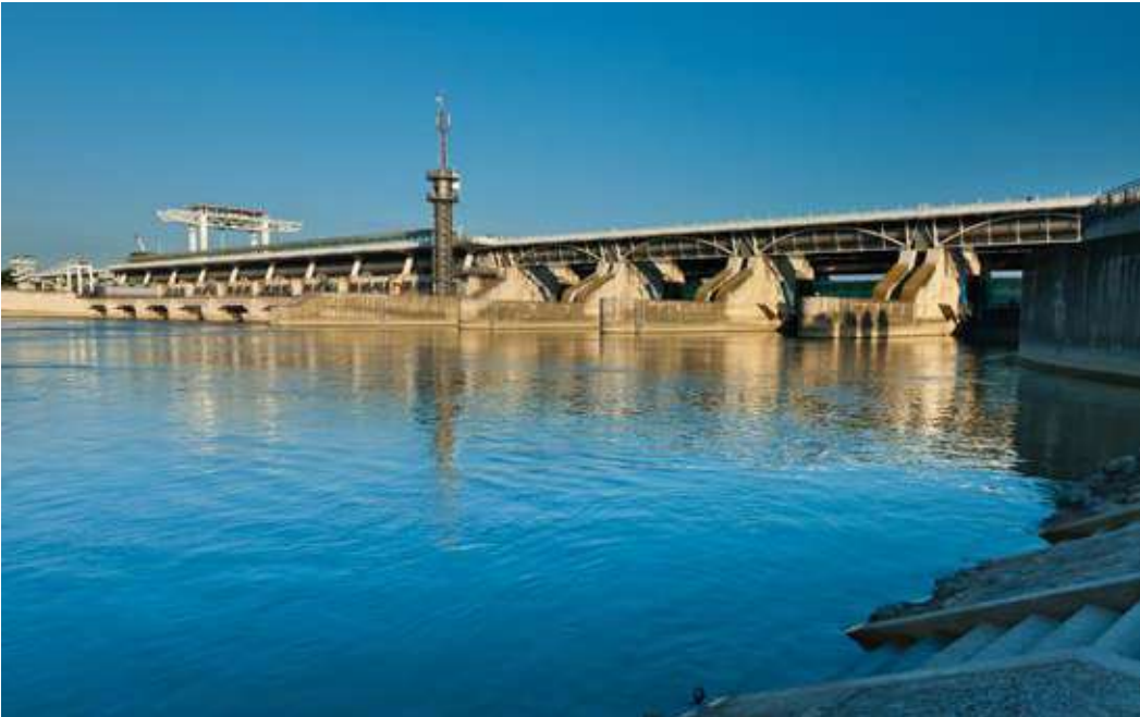
VERBUND's run-of-the-river power plant of Freudenau