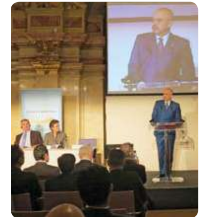
H.E. Mr. Edi Rama, Prime Minister of Albania, Patron of Vienna Economic Forum