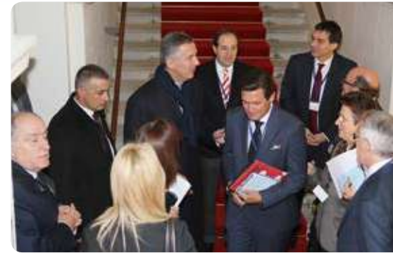
before the beginning